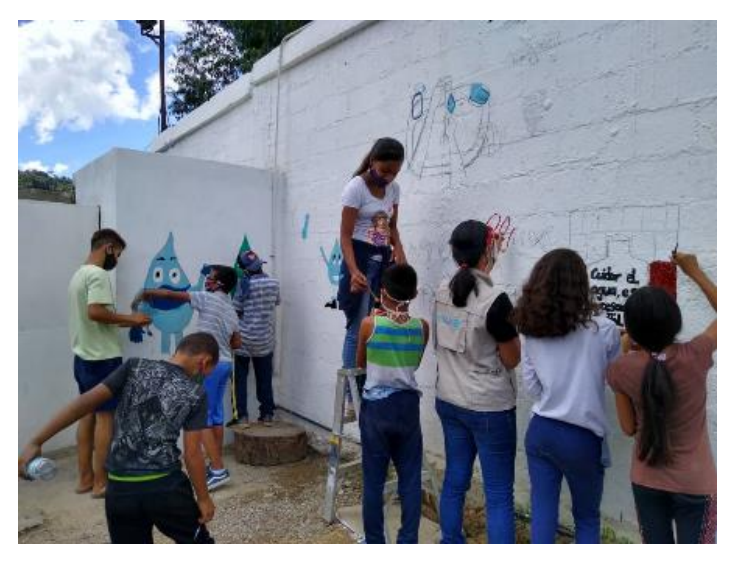
© UNICEF/2020/Espulga. As part of activities during Handwashing Day, UNICEF -together with members of the community Ojo de Agua and partner FUNDAN -, painted a wall with key hygiene messages in the community, Baruta, Miranda state.

Implementing partner ASONACOP created and published 14 videos involving children on handwashing and hygiene practices from different states. ASEINC reported an active participation of 86 children with special needs . FUNREAV carried out a story on hand washing with sign language. Printed material was distributed in PASIs located in Gran Caracas, including 4,624 flyers promoting menstrual hygiene -bearing in mind that UNICEF WASH kits contain sanitary pads-, and 1,500 flyers guiding families on the return to distance school. More than 2,657 people received messages via instant messaging and a total of 10,637 printed material items were delivered in priority