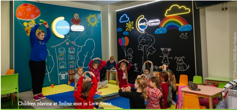
Children playing at Spilno spot in Lviv Arena.