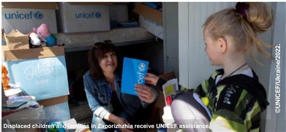
Displaced children and families in Zaporizhzhia receive UNICEF assistance.