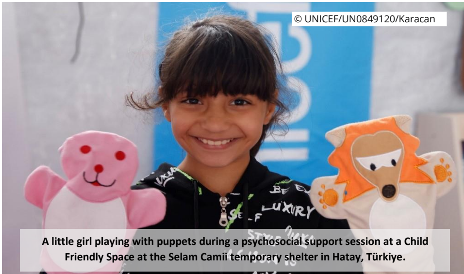
A little girl playing with puppets during a psychosocial support session at a Child Friendly Space at the Selam Camii temporary shelter in Hatay, Türkiye.