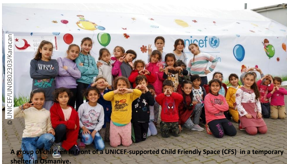
A group of children in front of a UNICEF-supported Child Friendly Space (CFS) in a temporary shelter in Osmaniye.