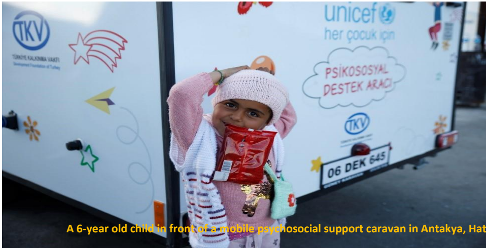
A 6-year old child in front of a mobile psychosocial support caravan in Antakya, Hatay.