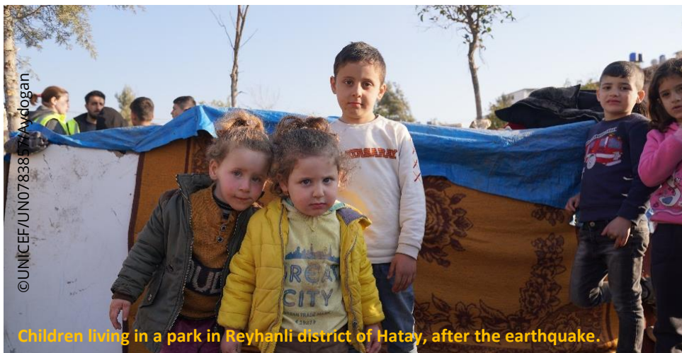
Children living in a park in Reyhanli district of Hatay, after the earthquake.