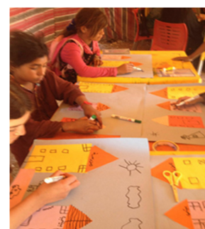
Makani Activities with Dom/Roma children in Rajeib /Amman

A Makani Plus project (including the core areas of psychosocial support (PSS), learning opportunities, and youth life skills training and WASH was implemented in 64 vulnerable communities (with a population of over 5,000) in Irbid, Karak, Mafraq, Madaba and Amman governorates through a package of interventions comprising psychosocial support (PSS), outreach, WASH, informal education and life skills. WASH infrastructure was implemented in 50 locations, benefitting 2,953 people. In June, an additional 10 centers opened allowing 147 children (79 boys and 68 girls) to access their services. With regard to informal education, classes were provided to a total of 571 children including 497 in vulnerable communities (246 boys and 251 girls), in addition to 74 children (27 boys and 47 girls) from the surrounding host communities. A further 533 children (301 boys and 232 girls) attended classes in other 30 locations. Makani also began outreach to minority groups. ICCS are offering informal education services to 2,813 children from ethnic minority groups and are engaging them in different activities. In June, there has been an increase of 300 children due to the gypsies and Turkman groups' stability in the area.