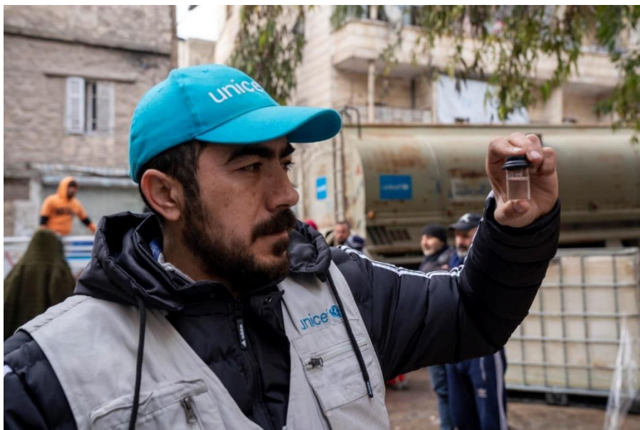
On 10 February 2023, a UNICEF Syria WASH Facilitator in Aleppo, checks the quality of trucked water in the Almyassar neighbourhood of Aleppo City.