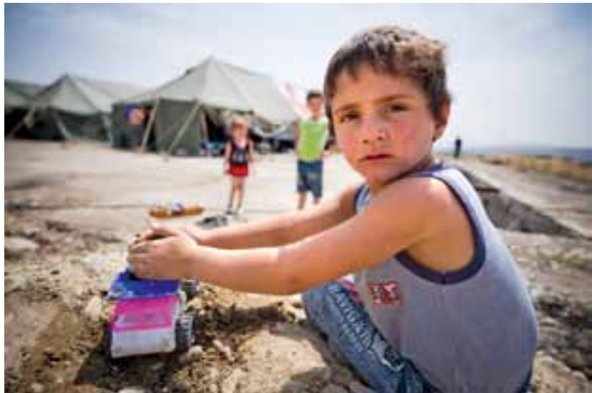
A boy plays with a toy truck in a camp for people displaced by the 2008 conflict in Georgia. He shares the camp with 200 people from the town of Gori and nearby villages, close to Tblisi.

Another way Supply is directly helping ensure children are protected is through our ethical procurement policies. UNICEF applies the highest international standards of social responsibility, ethical procurement, safety and regulatory compliance in all the products we procure and deliver to the field – including stringent child labour policies. Suppliers sign a statement acknowledging terms and conditions related to child labour provisions when they bid, and again when they sign contracts with UNICEF. In partnership with the International Labour Organization, we conduct site inspections to ensure suppliers are in compliance with our procurement policies.