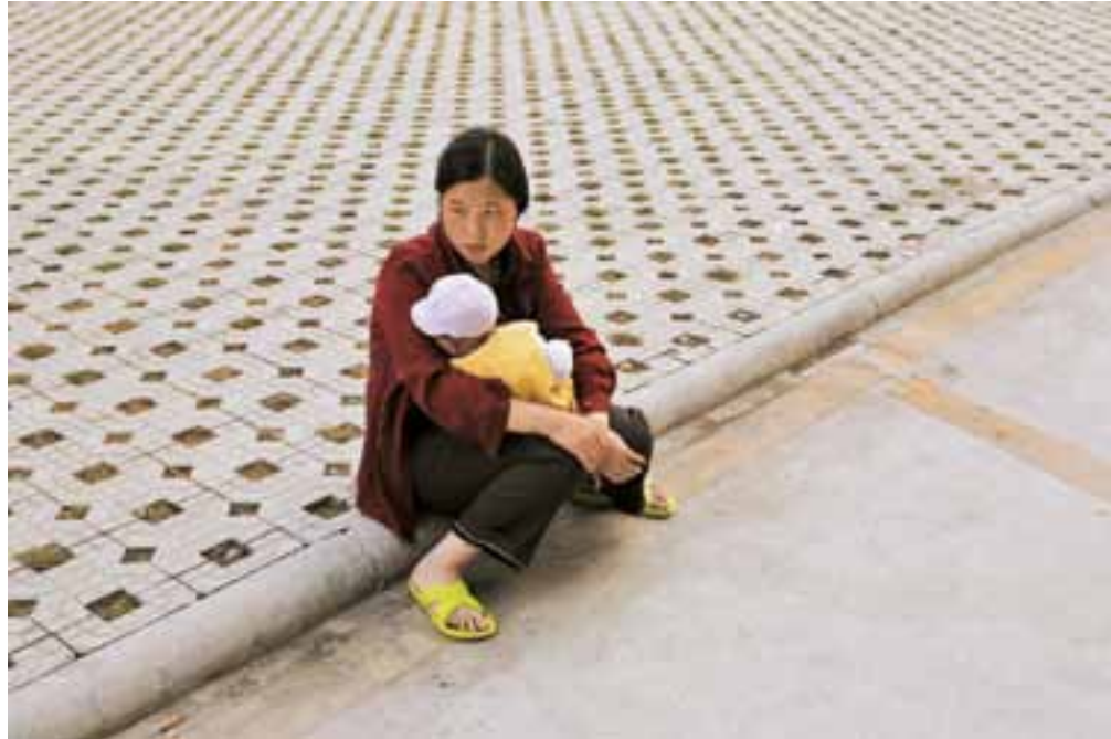
Woman feeds her child outside a camp established for people displaced by the May earthquake in the city of Mianyang in Sichuan Province, China.

In response to two major disasters in May 2008, Cyclone Nargis which killed an estimated 85,000 people, and directly affected 2.4 million, and the earthquake in the Sichuan province of China, which claimed the lives of 80,000 people and left five million homeless, tonnes of emergency supplies were sent from our different hubs, including our new hub in Shanghai which opened in April 2008. We also relied on support from our suppliers who directly delivered goods to the affected countries.