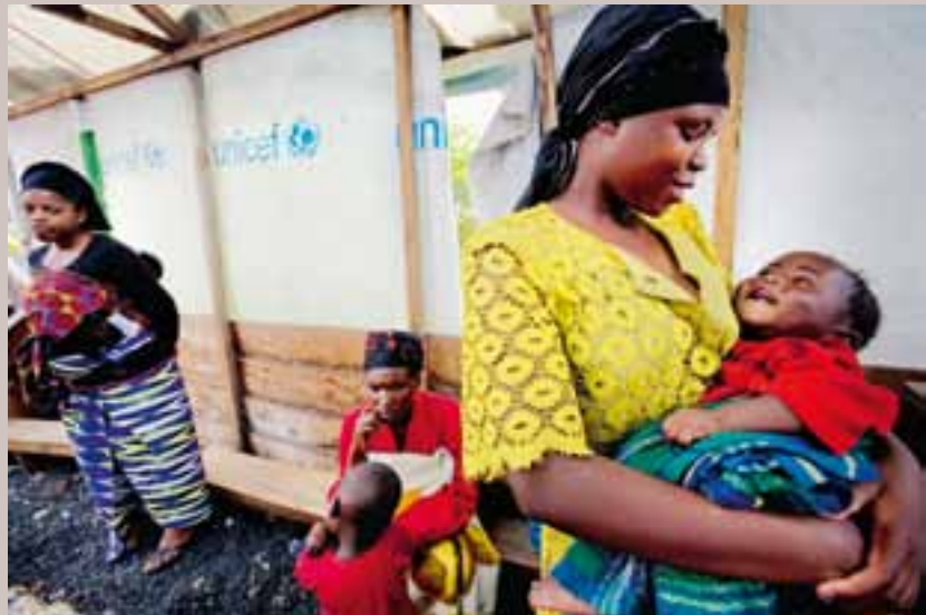
A woman cradles her baby as she and other mothers wait for their children to be vaccinated at a UNICEF-supported immunization centre in Goma, capital of North Kivu Province of the Democratic Republic of Congo. An estimated 60,000 children were vaccinated as part of an integrated emergency campaign during the ongoing conflict in the region.

From a Supply perspective this includes coordinating with different suppliers and carriers from all over the world to ensure on-time delivery of commodities, including cold chain equipment and syringes, working with in-country Supply staff to ensure sufficient warehouse space is available and the provision of logistics support.