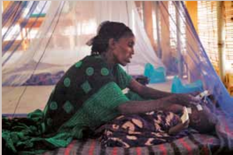
A woman tends to her severely malnourished daughter at the therapeutic feeding centre at the UNICEF-supported Wajir District Hospital in the north east of Kenya during the worst drought in the Horn of Africa for a decade.

Ensuring the global availability of LLINs is just part of Supply's efforts in the fight against malaria. In 2008, our warehouse and logistics team worked along-