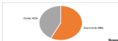
Reasons for dropping out

The lowest promotion rate for girls is between Grade 6 and Grade 7 (91%).