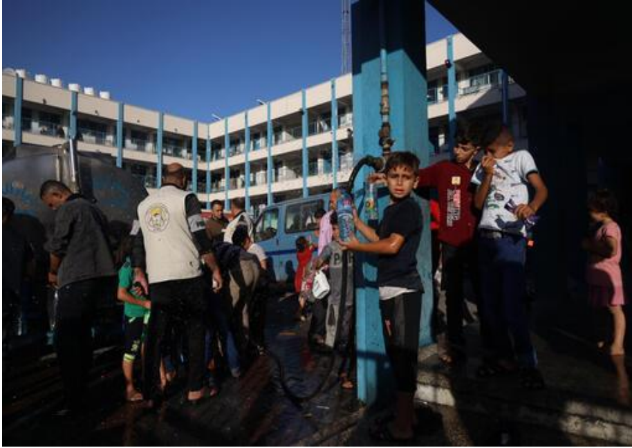
Children gather at a water truck to fill bottles with clean drinking water, 14 April 2021.