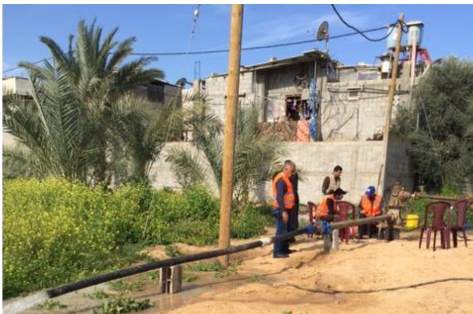
CMWU workers conduct a pumping test at the Deir AlBalah water well.

In Gaza, UNICEF in partnership with the Coastal Municipality Water Utility (CMWU) continued to provide safe water access to communities. In Rafah, the rehabilitation of the Jumaizat AlSabeel sewage pumping station is ongoing and a total 1,800 m of HDPE pipes have been installed. Works will be completed by mid-May, benefitting an estimated 120,000 people living in the surrounding communities. In Khan Younis, Maghazi and Dier AlBalah area, the reconstruction of three community water wells damaged in the 2014 war is ongoing. The excavation works have been completed in Maghazi and Dier AlBalah, and is being finalized in Khan Younis. Through this intervention, UNICEF and CMWU are targeting 1,800 households from all three communities.