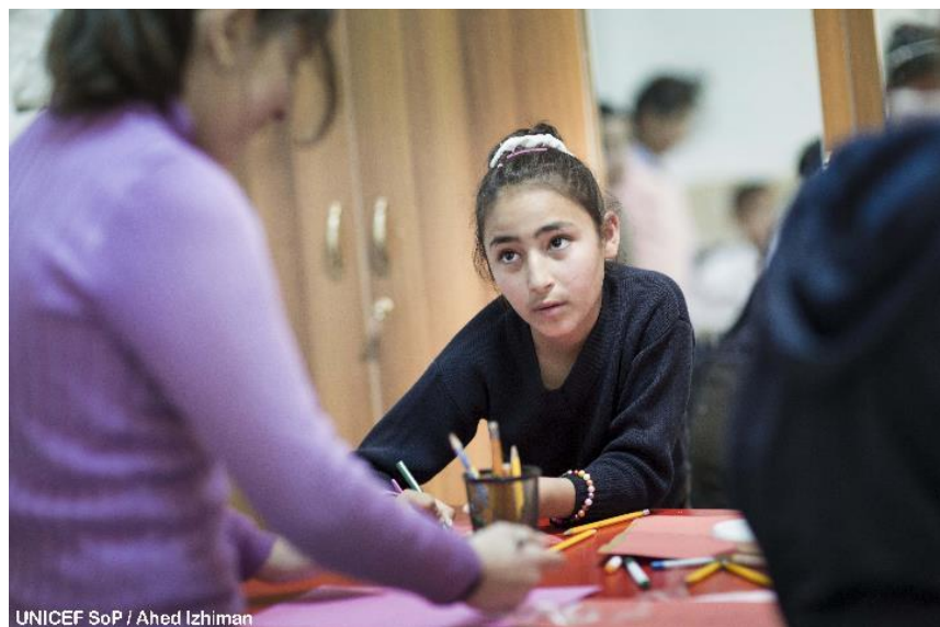
The child protection programme supports adolescents living in the very poor neighbourhood of Silwan, East Jerusalem, through awareness raising about child rights, positive coping methods, protection and legal aid.

In Gaza, 6,194 children (49% females) received psychosocial support including group and individual counseling, with support from UNICEF, the national NGO Ma'an Development Centre, the Tamer Institution for Community Education, and the Palestinian Centre for Democracy and Conflict Resolution (PCDCR). Additionally, 3,155 children (50% boys) received child protection services and engaged in life skills programmes through 28 Family Centers. Over 387 vulnerable children (221 boys and 166 girls) benefitted from case management. Awareness raising sessions for caregivers on the protection of their children and positive discipline have been organized across the Gaza Strip, for 14,876 caregivers (67% males).