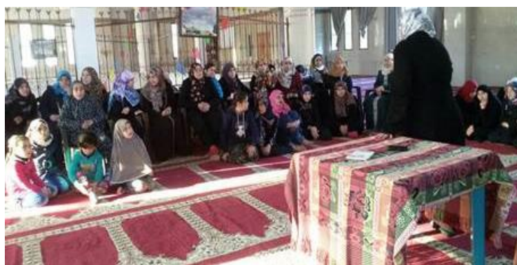
Women attending a breastfeeding counselling session in Gaza.

In Gaza, 16,916 mothers benefited from a comprehensive package of awareness raising activities covering breastfeeding, infant young child feeding practices, personal hygiene and communicable diseases prevention. In cooperation with the Ministry of Health, the sessions took place at community levels, including refugee camps.