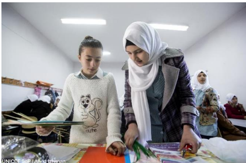
A youth entrepreneurship programme teaches children how to create small businesses or develop projects to change behaviours and social norms, here in Awarta, West Bank.

The Adolescent Development and Participation programme (ADAP) continued to support adolescents' trainings on social entrepreneurship and life skills and youth-led initiatives addressing issues of conflict, violence, and social cohesion. This was achieved in partnership with the Higher Council for Youth and Sports (HCYS), MAAN, Pal Vision, Palestine Education for Employment (PEFE) and Tamer. In March, 2,093 newly reached adolescents (43% female) have benefited from the programme. 2