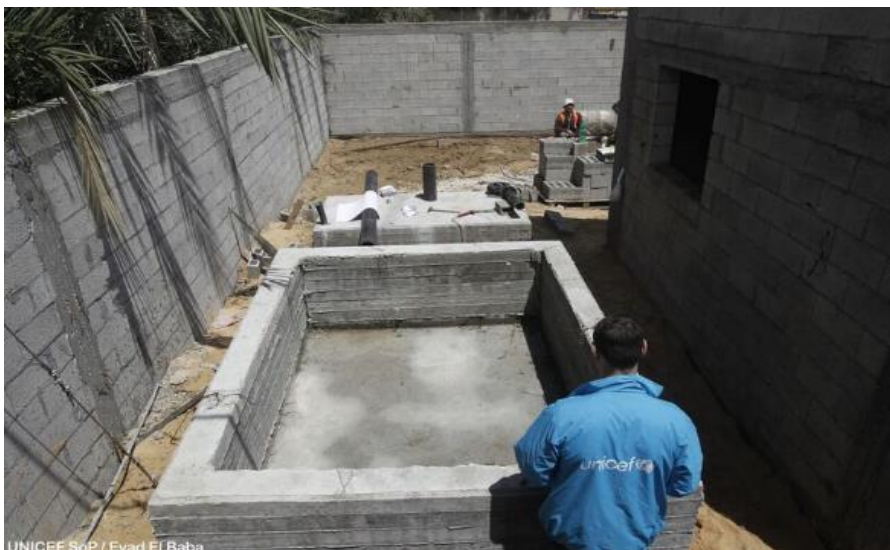
UNICEF field staff visits the water well of Dier AlBalah, in Gaza’s middle area, to supervise the status of construction works.

Progress was made to reconstruct the three wells in Khan Younis, Maghazi and Dier AlBalah which had been destroyed during the last war in Gaza. In coordination with CMWU, excavation works were completed in Khan Younis. 2 Electromechanical works, including the installation of well pumps, have started in all three wells and will continue until July-August 2016.