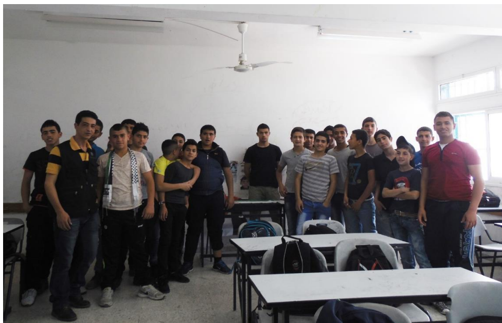
Boys from Aida School attend the “Know your rights” sessions organized in coordination with UNRWA.

In partnership with the United Nations Relief and Works Agency for Palestine Refugees in the Near East (UNRWA), UNICEF identified six UNRWA schools that will participate in the “Know your rights” programme. The purpose of this initiative is to sensitize children about their rights, and help them build coping strategies and resilience against violence. In April, 1,200 children from two UNRWA schools (Shu’fat and Aida Girls and Boys, grade 7-10) attended the “Know your rights” sessions. This programme will continue in May in order to reach the remaining four UNRWA schools. This project prioritizes children and adolescents living in the refugee camps most affected by episodes of violence with the Israel Defense Forces (IDF), including cases of stabbing carried out by young refugees.