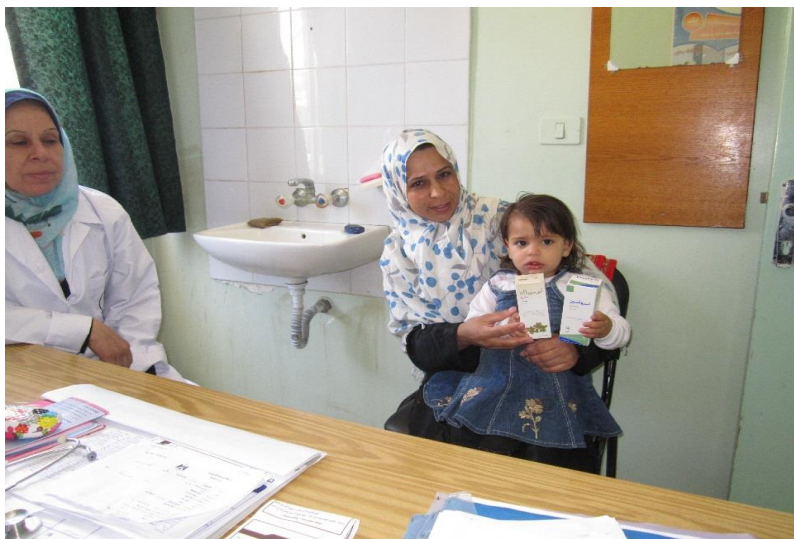
A mother and her child at the Sheikh Radwan primary health care center (Gaza city) receive essential medicines UNICEF distributed in coordination with the Ministry of Health.

To address priority needs identified in the Micronutrient Survey Report 6 , UNICEF supported the Ministry of Health through the procurement of micronutrients supplements for Gaza and the West Bank. These supplies were distributed in April to 38 primary healthcare centers, in partnership with the national NGO Palestinian Medical Relief Society (PMRS) and the Ministry of Health. In April, 21,841 pregnant and lactating women (14,341 in Gaza and 7,500 in the West Bank) received micronutrient supplementation in all 550 targeted health facilities. In addition, 9,597 under-five children (49% girls) benefitted from the distribution of micronutrients supplements, including Vitamin A.