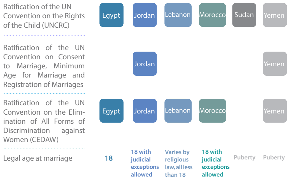
Figure 2: International commitments

Despite the fact that most countries studied have ratified international conventions, including CEDAW and CRC, which set the minimum age of marriage at 18, exceptions to key provisions of these conventions allow child marriage to remain legal in certain circumstances in most countries. Of the six countries, all have ratified the Convention on the Rights of the Child (CRC). The Committee for the Rights of the Child considers that the minimum age for marriage must be 18 years. Additionally, apart from Sudan, all countries have ratified the Convention on the Elimination of all forms of Discrimination Against Women (CEDAW), which restricts states from giving legal effect to marriages that involve children, and urges states to specify a minimum age for marriage. However, although most countries have ratified CRC and CEDAW, many reservations remain outstanding. Egypt remains the only country with a minimum age for marriage of 18 without judicial exception. Jordan and Morocco have both set the legal age for marriage as 18 but provide judges with the discretion to marry girls that are younger. In both Sudan and Yemen, puberty is broadly used as the age at which marriage of girls is appropriate and acceptable. In Lebanon, religious law determines the age of marriage, which varies depending on the religion and denomination.