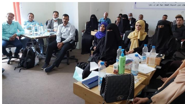
Participants in Life-skills Training Programme

Monthly coordination meetings were conducted for 265 community committees and community volunteers (79 female; 186 male) to evaluate community initiatives and community outreach activities. A new community initiative promoting the right to education/back to school was developed in Sana'a governorate, reaching 5,412 individuals (2,558 males; 2,854 females) with information on floods in Amanat Al Asimah as well as 1,987 individuals (1,117 male; 870 female) on outreach activities on the right to education which resulted in returning 200 students to schools and supported 50 Muhamasheen children to buy the notebooks and pens. In addition, 45 cleaning campaigns in 55 informal settlements in Amanat Al Asimah and Sana'a were conducted benefiting 12,169 individuals.