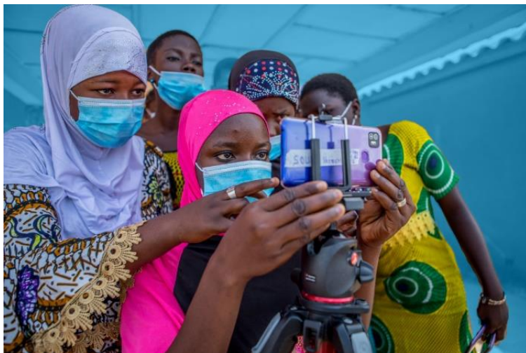
Adolescent girls receiving cash transfers as part of the FAABA-COVID project participate in a photography and vlogging workshop in Kandi