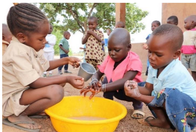
Pre-school children wash their hands together before eating lunch at a UNICEF-supported childhood space at Boni primary school, Northern Benin

UNICEF, in partnership with decentralized directions of hygiene and sanitation, intensified awareness sessions on prevention measures, hand hygiene, water treatment and mask wearing in Littoral, Atlantique and Ouémé. Research on handwashing practices in Benin revealed differential coverage from one region and municipality to another. Handwashing devices could be found in 68 per cent of public spaces in the Littoral. In the Atlantic, only 8 per cent of public spaces and households had handwashing devices and 12 per cent in Ouémé region. At least 46,698 additional women learned how to practice water treatment. A total of 1,648 wells were disinfected. UNICEF reached a total of 291,126 people through wells disinfection and distributed more than 140,000 aquatabs tablets. 665,545 people benefited from critical WASH supply and services.