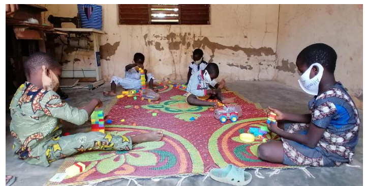
Children playing in a child friendly space in Bantè, Collines department

At the community level, 1,032 new community leaders (432 women) received information on COVID-19 prevention and protection measures. In turn, they reached out to 4,302 new children (1,995 girls) and 3,159 adults (1,502 women) to prevent and protect children from violence in the COVID-19 context. Through community surveillance mechanisms, 89 suspected and/or confirmed cases of persons infected with COVID-19 (52 children, 37 adults) were identified and referred to health centers.