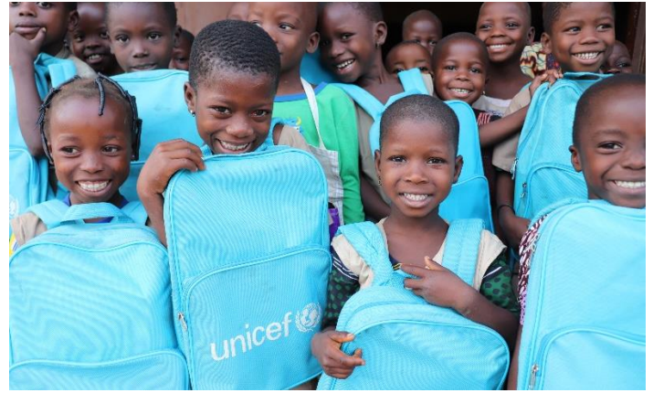
Primary school children in Zogbodomey who received their school supplies through the national back to school campaign

The 2020-2021 academic year started on 28 September. UNICEF and its partners provided Ministries of Education with handwashing equipment, sanitizers and sensitization materials to ensure all children could go back to school in a safe secure environment. Through the Global Partnership for Education (GPE), UNICEF, the Swiss Cooperation, EDUCO, Plan International and the World Bank supported the back-to-school campaign and provided school supplies to 214,071 children including 100,943 girls enrolled in primary schools and 32,672 adolescent girls in lower secondary schools in vulnerable districts. As part of the GPE COVID-19 response programme, UNICEF signed an agreement with the Government of Benin to distribute school supplies and handwashing equipment, for a total of US $ 2,9 million. School supplies will be distributed to 80,605 vulnerable children in nine communes, while 20,440 hand washing stations will be provided to 9.900 schools nationwide.