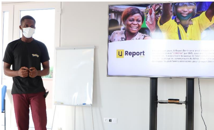
Young entrepreneurs present the UReport Benin app they developed during an innovation bootcamp organized as part of the #HACKCOVID19 hackathon

The Country office reached an additional 10,000 people through mass and social media in the last month. During the reporting period, in collaboration with the Departmental Directorates of Social Affairs in charge of Children protection, community relays and volunteers organized home visits and group discussions reaching 189.601 people (148,367 adults and 41,234 children) on COVID-19 protective measures and child protection messages and 3,716 community leaders engaged for sensitizing community members. In the health sector, data provided by 10 Health zones mentioned that 37.288 parents are reached by community relays who integrated COVID-19 protective measures and messages into their routine activities. To date, 1,082,932 people were engaged on COVID-19 prevention activities. In collaboration with 20 local radios and 2 televisions, radio spots on breastfeeding, seeking care and correct use of masks are broadcasted every week in French and local languages from November 2020 to February 2021. Finally, 2,595 people are sharing their concerns and asking questions/clarifications to the community relays and volunteers about COVID-19 protective measures.