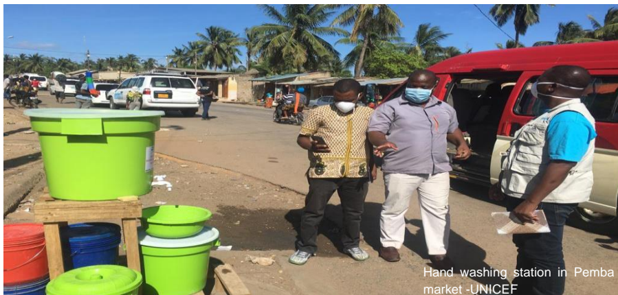
Hand washing in Pemba market