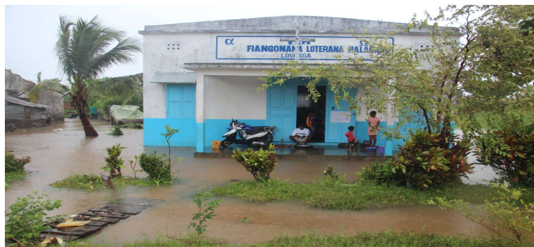
Floods after Eliakim cyclone, Antalaha, Sava region