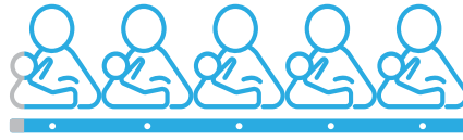
Figure 1 Share of babies that are breastfed in high-, low- and middle-income countries.

In low- and middle-income countries, almost all babies are breastfed