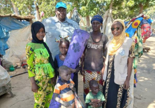
Orphaned children on the military camp IDP site in Kousseri receive a mat and blanket.