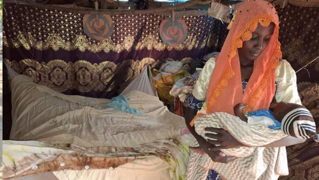
A young women with a small child on the Gore IDP site in Kousseri received a mosquito net.