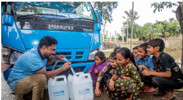
DPHE team members, with support from UNICEF, distribute drinking water using a mobile water treatment plant to children in Komolganj Union, Moulvibazar, Sylhet, on 29th August 2024, as part of the emergency flood response.

Currently, 13 WASH cluster members, including BRAC, BDRCS, IFRC, CARE, Muslim Aid, Oxfam, Save the Children, and others, are providing essential WASH services to complement the government response. For eastern flood response, the Department of Public Health Engineering (DPHE) installed 20 floating latrines and 43 temporary tube wells in flood-affected districts such as Feni, Noakhali, Comilla, Lakshmipur, and Moulvibazar. Additionally, 300 DPHE tube-well mechanics inspected 18,834 tube wells, repairing 3,809 and disinfecting 2,322 to ensure access to safe drinking water. In collaboration with UNICEF, DPHE distributed 3.7 million water purification tablets, 4,300 hygiene kits, and 28,000 jerry cans in the flood-affected districts of Chattogram and Sylhet divisions. A total of 87,380 people received 218,450 litres of treated drinking water using 10 Mobile Water Treatment Plants in various districts, and over 225,000 leaflets were distributed with water purification tablets, providing instructions on their proper use.