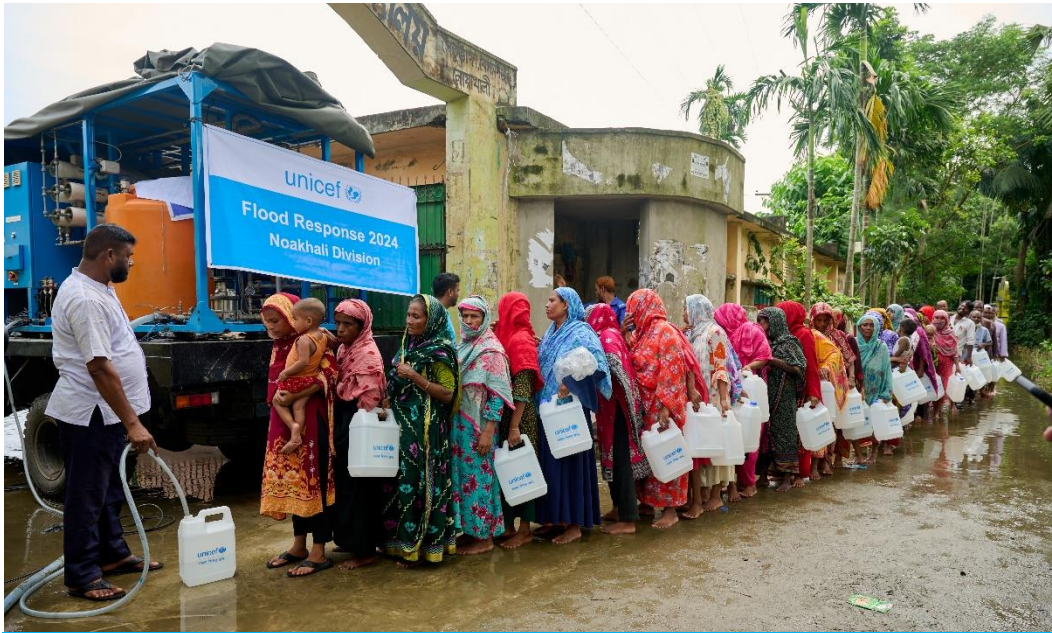
Flood-affected community members receiving water from a Mobile Water Treatment Plant managed by the DPHE with support from UNICEF. in Noakhali, Chittagong.