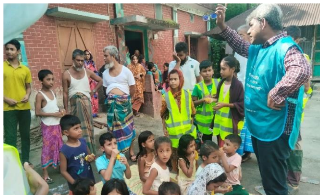
Child Rights Facilitators from Ministry of Women and Children Affairs (MoWCA) are coaching community volunteers on managing the Child-Friendly Space for Accelerated Protection of Children in Noakhali.