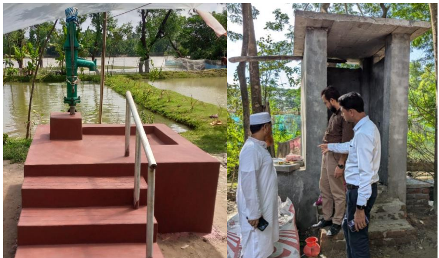
A climate-resilient water point completed as part of the Cyclone Remal response with a twin-pit latrine under construction in the left picture.