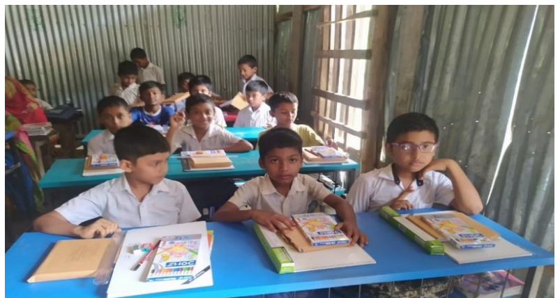
With UNICEF support, children received education supplies under the Cyclone REMAL response.