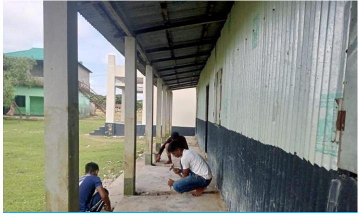
Renovation work is currently underway at Himu Tin Para High School, located in Jaintapur Upazila, Sylhet District, as part of ongoing efforts to repair damage to school infrastructure.

In the Child Protection sector, approximately 2.06 million children and adolescents, including 520,000 aged 0-4 years, have been directly affected, heightening risks such as violence, abuse, exploitation, gender-based violence, child labor, trafficking, and child marriage, particularly in overcrowded temporary shelters with inadequate privacy and security. The destruction of livelihoods has intensified economic pressures, pushing children into child marriage, and hazardous labor to support their families. There is a pressing need to establish child-friendly spaces, mental health services, and protection mechanisms, especially for vulnerable children, including those with disabilities or those separated from their families due to the flash flood.