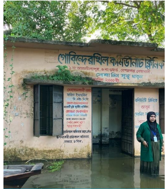
Many community clinics remains inundated in the flood-affected areas.