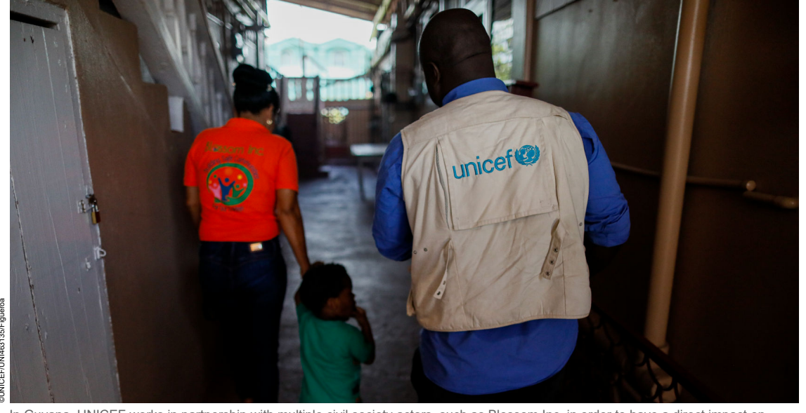
In Guyana, UNICEF works in partnership with multiple civil society actors, such as Blossom Inc, in order to have a direct impact on children and their families