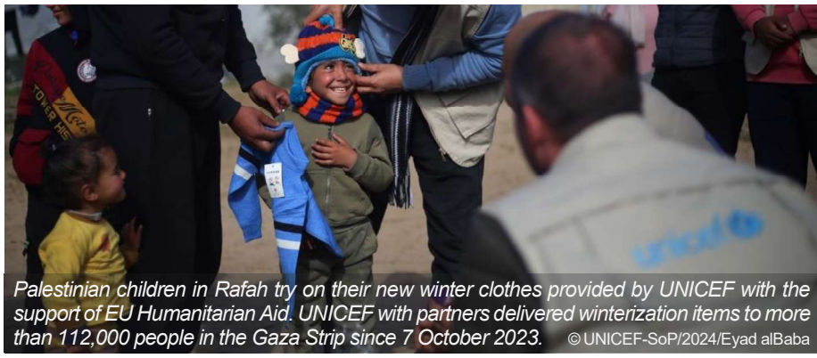
Palestinian children in Rafah try on their new winter clothes provided by UNICEF with the support of EU Humanitarian Aid. UNICEF with partners delivered winterization items to more than 112,000 people in the Gaza Strip since 7 October 2023.