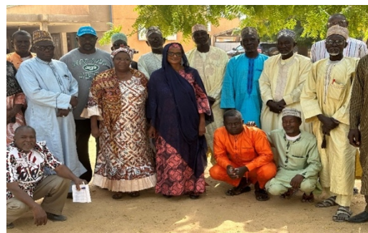
Meeting with neighborhood leaders, Maradi Health District, Maradi region. UNICEF is engaging with community leaders to ensure their active involvement in the dissemination of positive messages.