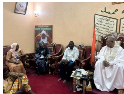
Meeting with the Sultan of Zinder © UNICEF, Fati Hamza, October 2023.