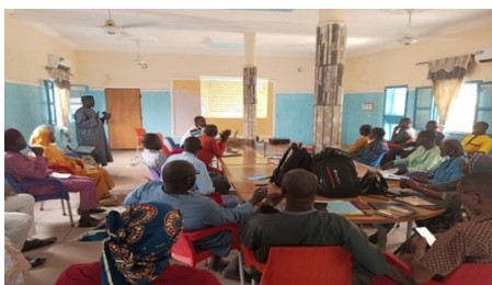
Training of healthcare personnel, Mirriah Health District, Zinder region. UNICEF is committed to ensuring that health workers have the capacities to provide appropriate health care to the patients.