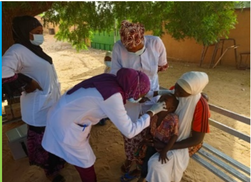
Consultation of a child at the Kantche site, Matamaye Health District, Zinder region. UNICEF ensures access to healthcare for every child, aiming to minimize the effects of illness.

Flash Update Diphtheria # 01 10 November 2023