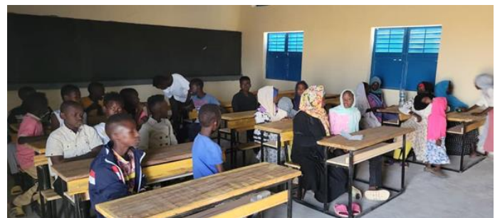
Back to school for refugee and asylum seeking children at the humanitarian center school in Agadez. UNICEF ensures that every child, regardless of their circumstances, has access to quality education