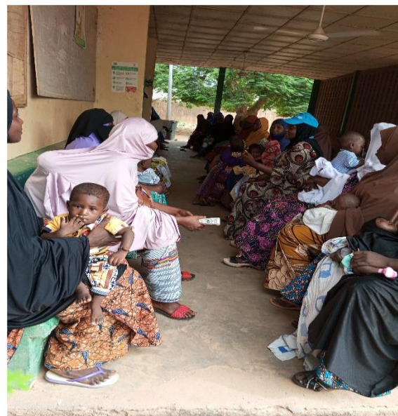
Interview to collect social and behavioral data at the integrated health centre of Lacouroussou in Dosso region. UNICEF ensures that communities are educated, empowered, and engaged in their own well-being and development.