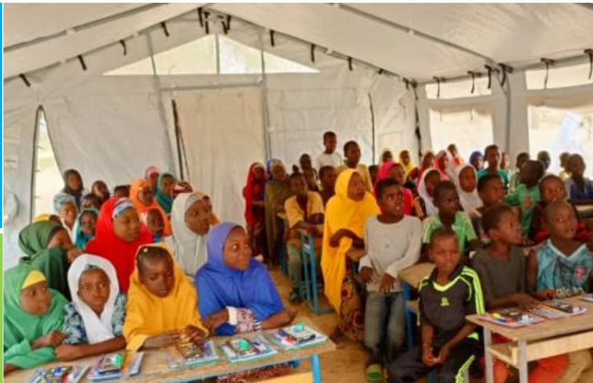
Tents of 48m 2 installed at the site for displaced people in Diffa region. UNICEF continues to ensure the continuity of education in emergency contexts.