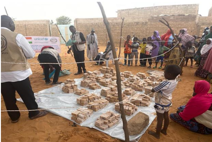
Distribution soap and water treatment products in Madaoua, Tahoua region, in response to the flood on Oct. 10, 2023. UNICEF continue to provide assistance to people affected by natural disaster.