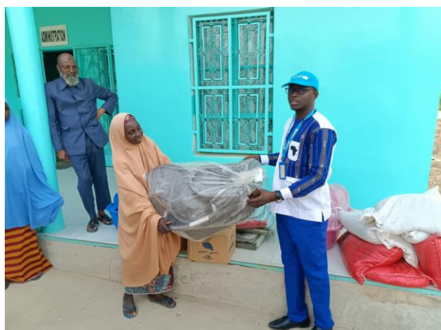
A mother of triplets receives assistance with food and essential household items. UNICEF is committed to the well-being of children and women in need.