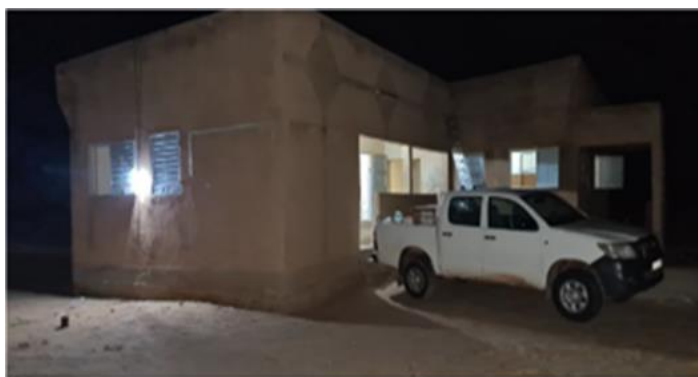
UNICEF has facilitated the electrification of the integrated health centre (CSI) of Mafaroua, in Maradi Region. UNICEF continues to improve the healthcare environment in health facilities.