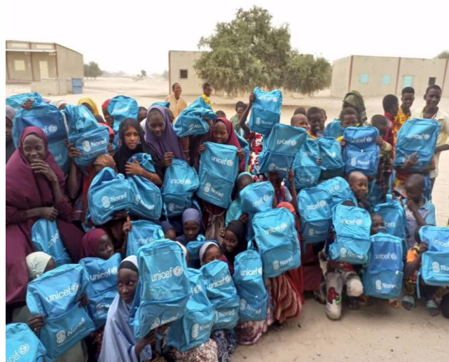
Children receiving individual kits in Diffa region. UNICEF supports the back-to-school campaign, ensuring a smooth transition back to school for numerous children.