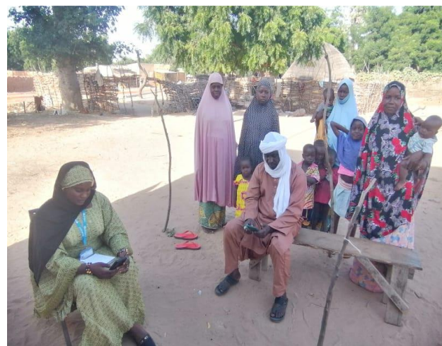
A social and behavioral survey for immunization in the integrated health centre of Mokko, in Dosso region. UNICEF continues to advocate for comprehensive vaccination programs, aiming to safeguard the health and well-being of every child.