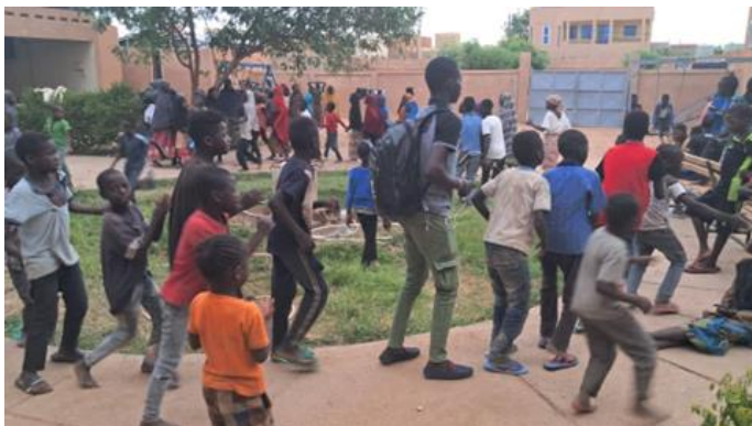
Unaccompanied children expelled from Algeria, welcomed and taken care of at the Transit and Orientation Centre. UNICEF implements reception and referral systems for the well-being of unaccompanied children.