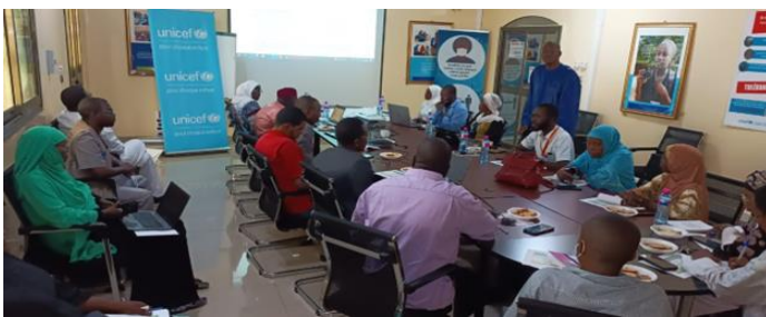
Workshop on investing in the in the rights of girls: our leadership, our well-being" and the mechanism for monitoring and reporting serious violations of children's rights. UNICEF is committed to empower girls and safeguarding children's rights