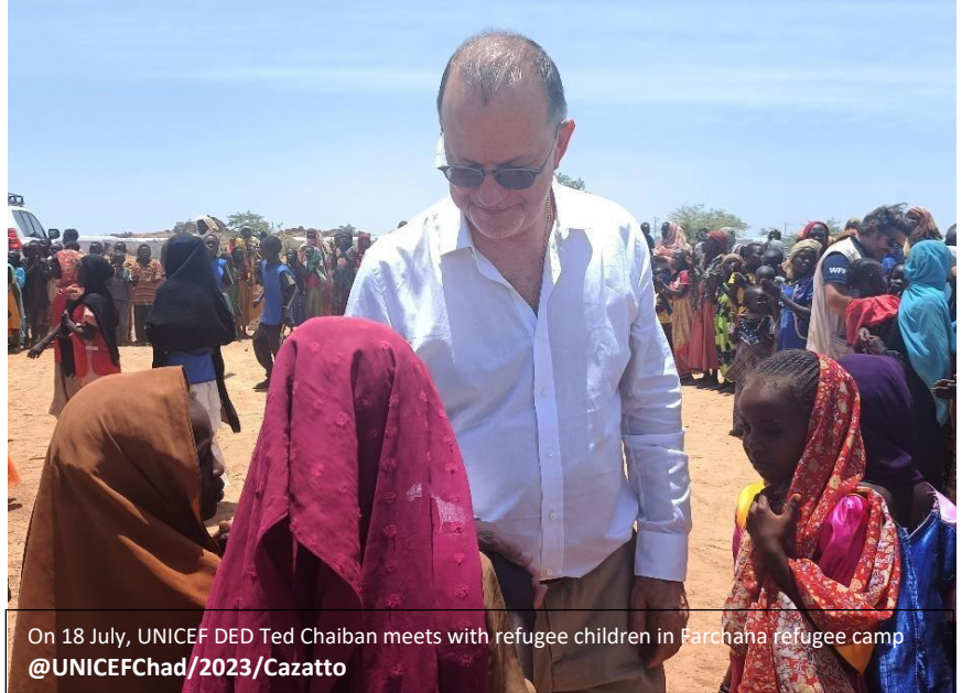
On 18 July, UNICEF DED Ted Chaiban meets with refugee children in Farchana refugee camp