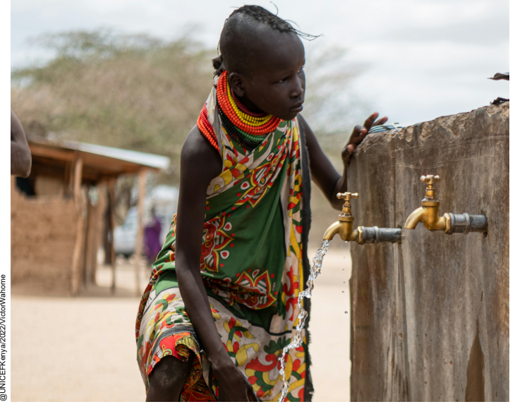
A girl fetches safe water at UNICEF-supported borehole in Sopel village, Turkana County