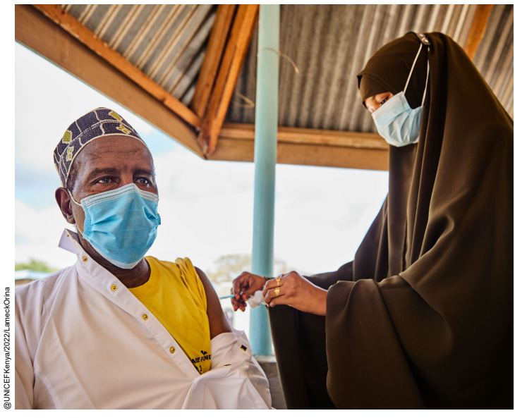
A man gets his COVID-19 vaccine at Garissa County Referral Hospital

A total of 2,556 people (1,536 women and 657 men) in 41 villages in three sub counties (Dadaab, Fafi and Hulugho) of Garissa county with cross-border pre-mobilisation on access to integrated outreach services and routine child vaccination services, through which over 1,200 children were vaccinated.