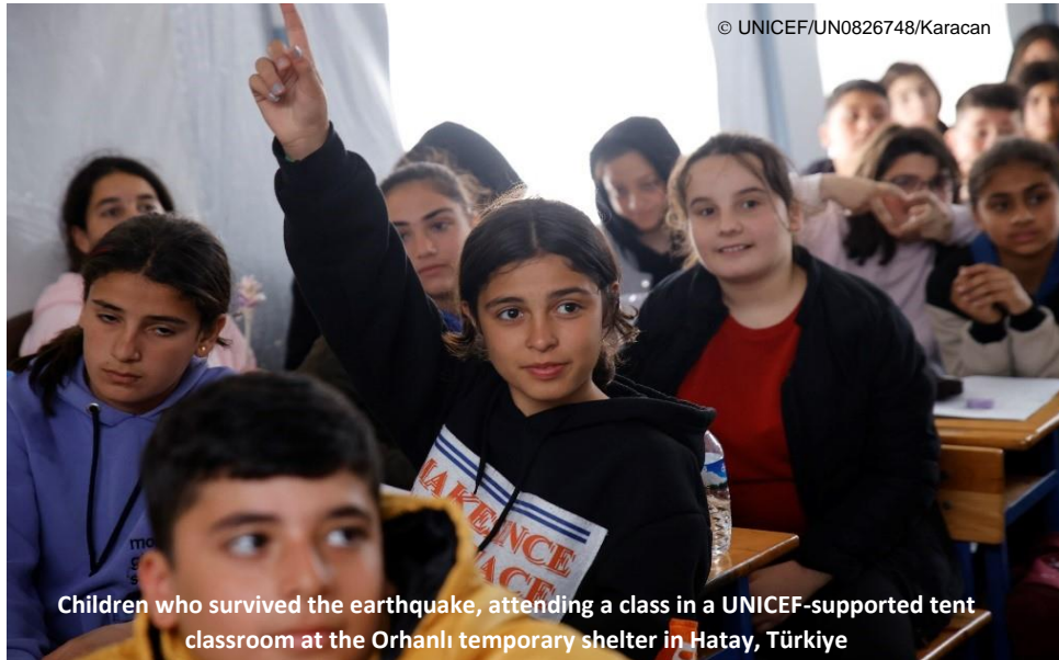
Children who survived the earthquake, attending a class in a UNICEF-supported tent classroom at the Orhanlı temporary shelter in Hatay, Türkiye