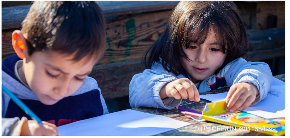
Displaced children participate in recreational activities provided by UNICEF-supported volunteers at a collective shelter in rural Lattakia, northwest Syria.