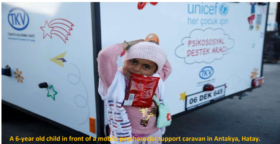
A 6-year old child in front of a mobile psychosocial support caravan in Antakya, Hatay.