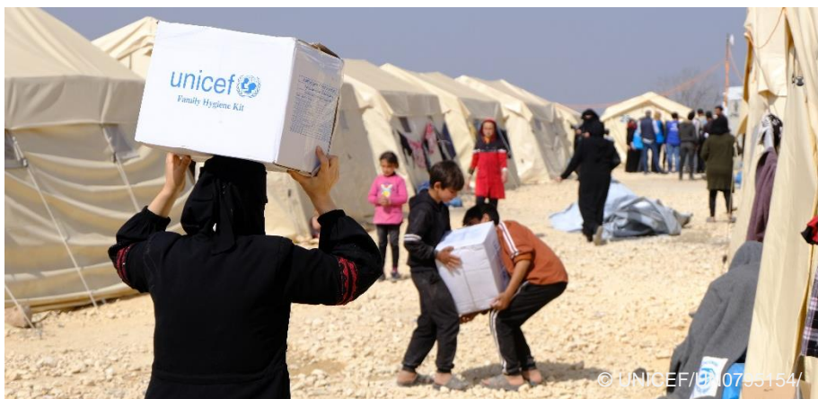
UNICEF hygiene kits are distributed at a camp in A'zaz, northwest Syria, for families displaced by the earthquakes.