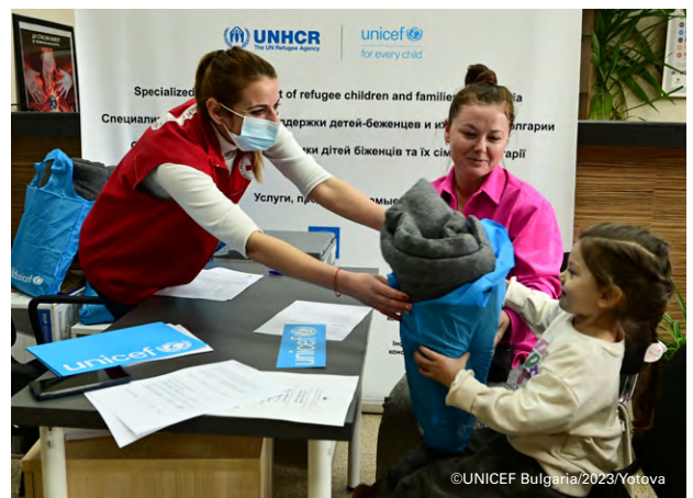
Refugee families collect winter supplies from UNICEF at the Blue Dot in Sofia, established by UNICEF and UNHCR in partnership with Bulgarian Red Cross.

Six UNICEF/UNHCR Blue Dots were established in key locations to provide immediate support to refugees from Ukraine. More than 17,940 children and 40,307 adults were reached by the 35 trained frontline workers who provided psychosocial support, risk identification, provision of information, referrals, mediation in front of state authorities, legal aid, counselling, and recreational activities for children in the child-friendly spaces. Within the system strengthening approach, UNICEF is preparing to transition the Blue Dots into sustainable community hubs, open to all vulnerable families.