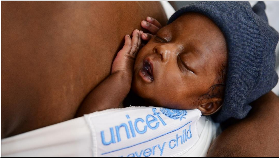
A young mother practicing Kangaroo care thanks to UNICEF support, in the South-West region of Cameroon