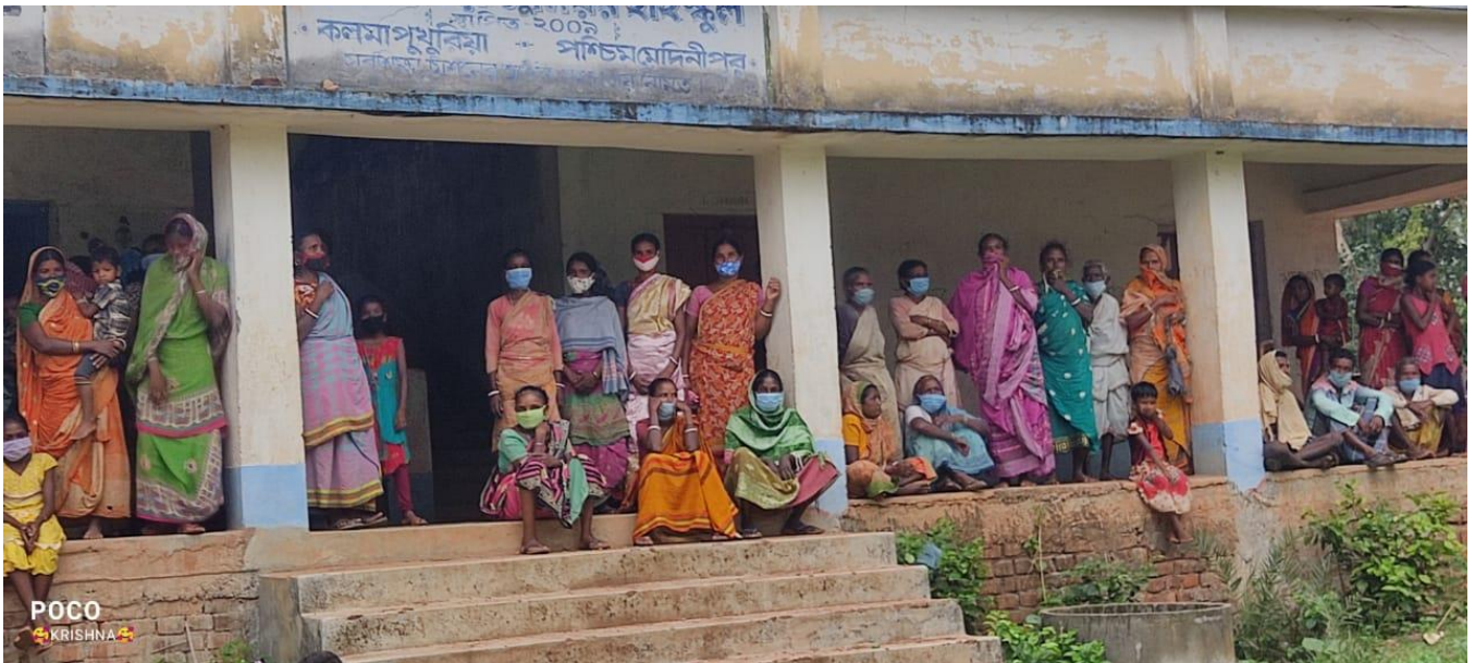
Rescue Camp in Naryagram Block, Jhargram District -by State IAG West Bengal.