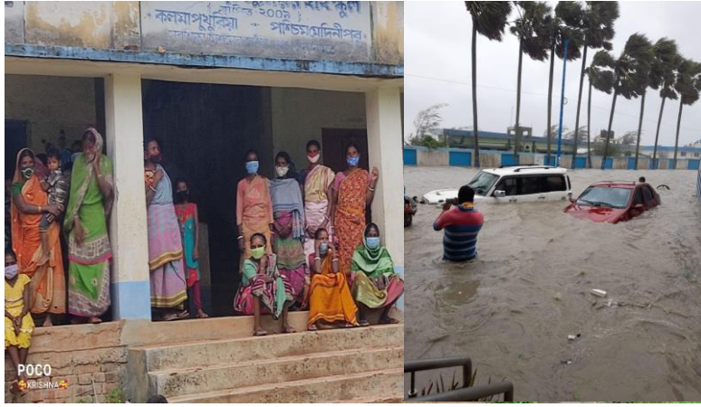
Rescued people in Shelter at East Medinipur District