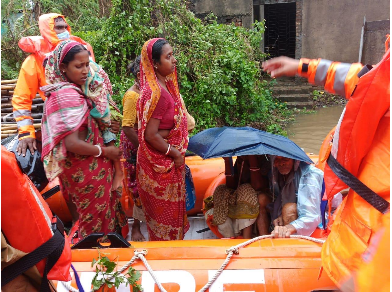
Rescue operation by NDRF in East Medinipur District