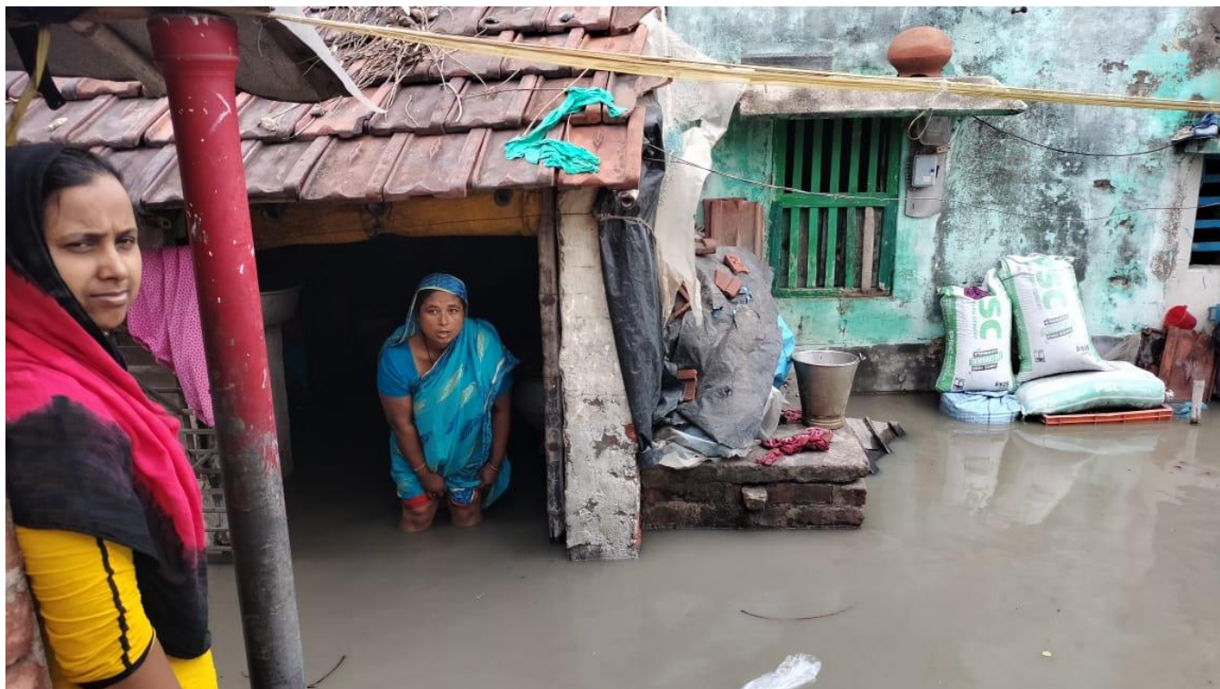
Inundated Village of Basirhat Block of North 24 Parganas- Courtesy-State IAG West Bengal