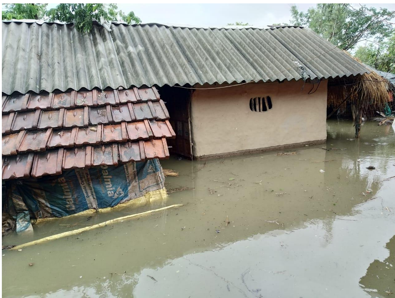
Inundated Village of Raidigi in South 24 Parganas District