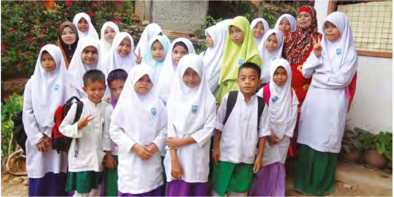
Students leaving after classes at the Telipok Learning Centre run by the NSC in Kota Kinabalu, Sabah

On the one hand the NSC is an authoritarian law enforcement agency tasked with maintaining security, running detention centres and cracking down on activities that can endanger the state or its citizens, while on the other, it is playing the role of a caring, humanitarian organisation providing basic primary education in 12 ALCs for undocumented and Filipino refugee children. However, some believe the NSC's role in education has little to do with the Government or the system but is a result of good task force directors. 81