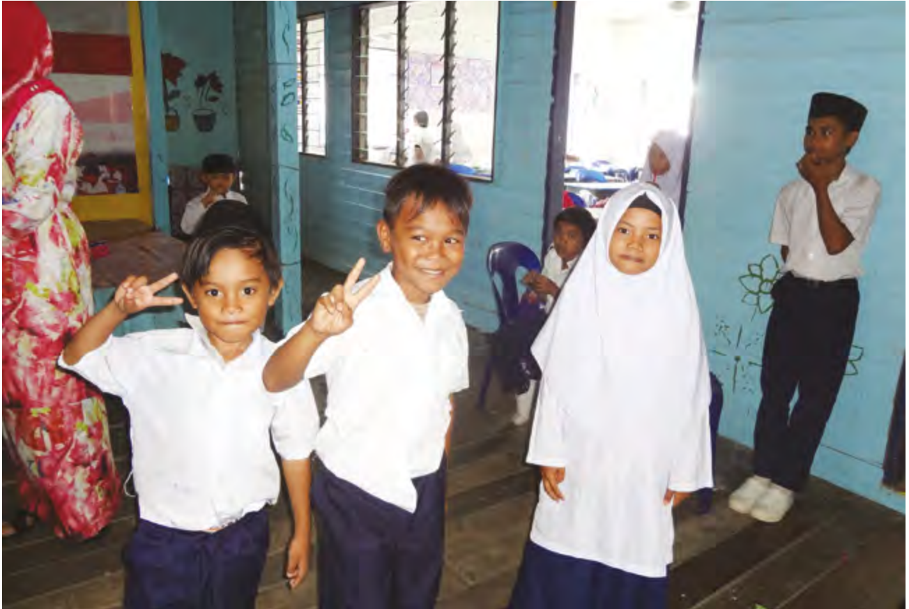
Children at the Kg Numbak Alternative Learning Centre in Kota Kinabalu, Sabah