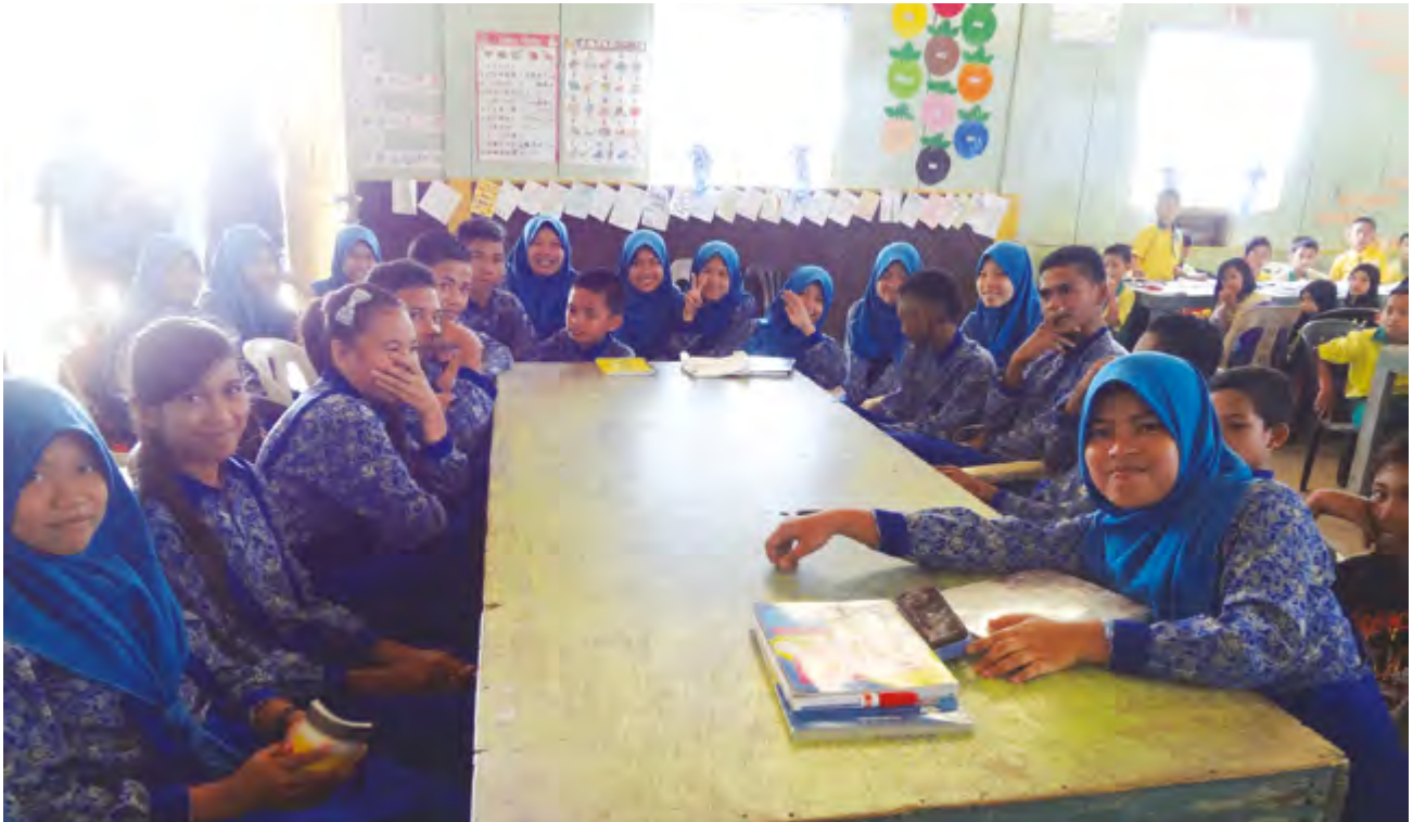
Indonesian girls in Grades 7 to 9 giggling as a class is underway at the Sungai Balung CLC. They are grouped together and share the space with the children from the HCASS learning centre.