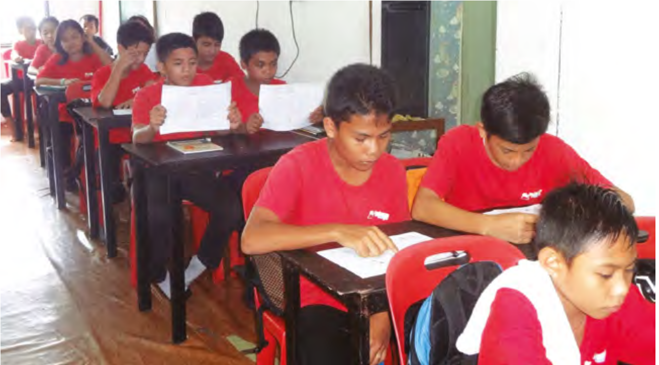
Children seen studying at the Stairway to Hope CLC in Kota Kinabalu, Sabah.