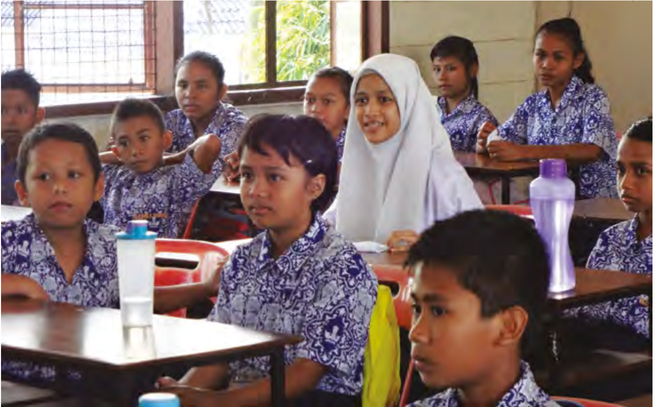
One of the best run Indonesian CLCs is the the Holy Trinity Catholic Church in Tawau.

Indonesia has a vibrant alternative education model in place for dropouts and older children within its borders. It has replicated the same strategy in its CLCs in Malaysia, where Package A is the equivalent of primary grade, Package B is for secondary and package C is for high school students. The first Indonesian CLC following this model was opened in Keningau in 2003 and in 2006, after the G2G deal more such centres were opened.