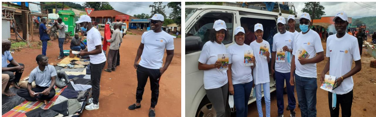
Rotary March in the Streets for awareness of Round One Campaign