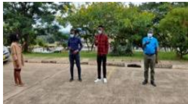
Field exercise during IM training at the district level