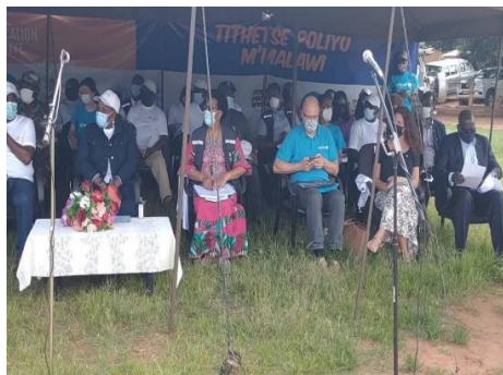
Fig. 2: Launch of Round One Campaign by Minister of Health and Partners