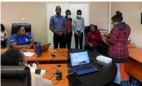
Role play during LQAS training at national level