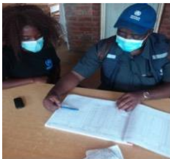
Fig. 4: Mentorship on Active AFP surveillance in the districts