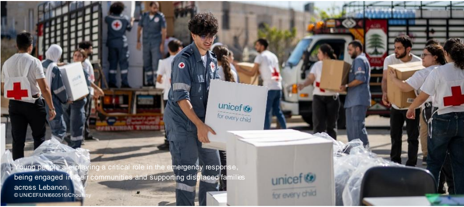
Young people are playing a critical role in the emergency response, being engaged in their communities and supporting displaced families across Lebanon.