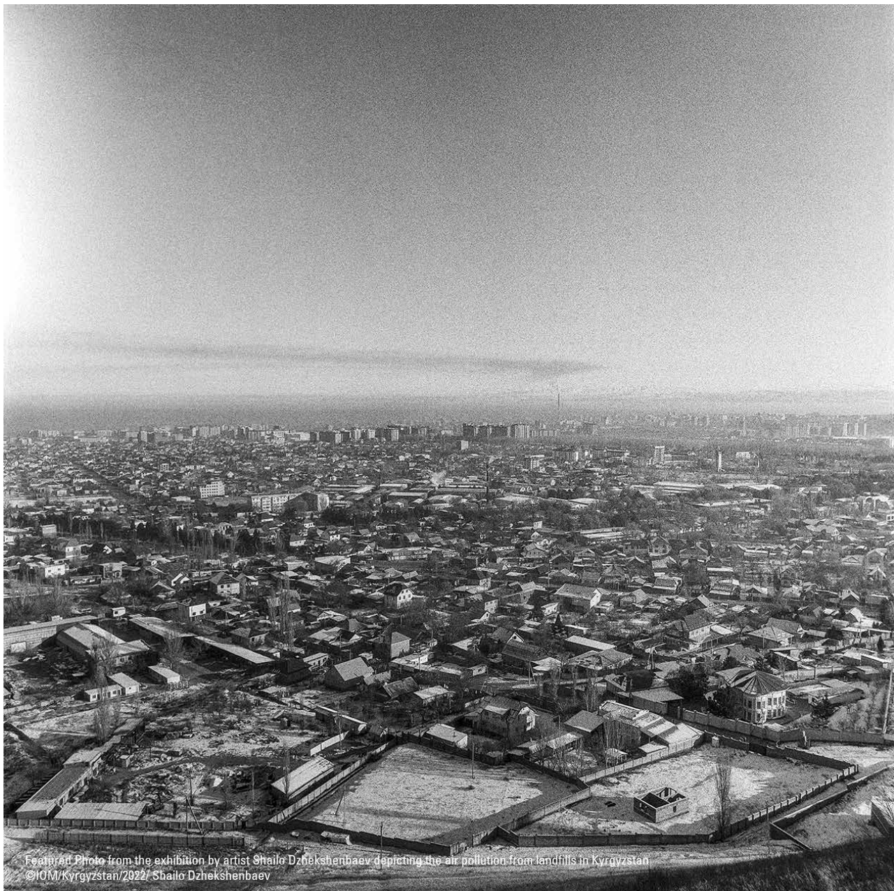
Featured Photo from the exhibition by artist Shailo Dzhekshenbaev depicting the air pollution from landfills in Kyrgyzstan