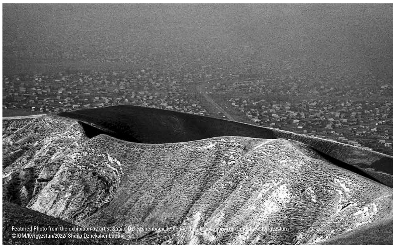
Featured Photo from the exhibition by artist Shailo Dzhekshenbaev depicting the air pollution from landfills in Kyrgyzstan

Internet of Good Things (IoGT) - Internet of Good Things is a mobile-ready website that enables free access to content without data charges in 63 countries in 13 languages.