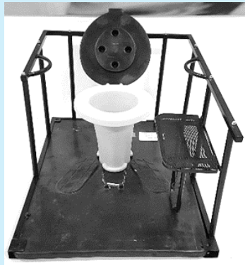
Product 2: The parts assemble and fit over the plate, providing support along one side in addition to a transfer point for those with mobility disabilities to move from a mobility aid to the seat. This product needs to be installed before setting the plate in place.