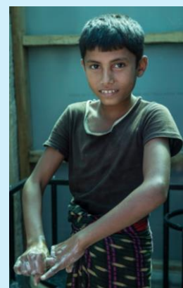
Full story: https://spark.adobe.com/page/djGCTF3M3iI/SL/