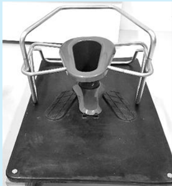
Product 1: The parts assemble and screw onto the plate, providing a frame to support a person to lower onto the seat. The frame is quick to install and leaves free space around the plate for easy maneuverability. It can be installed after the plate is already in use.