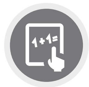
THE OVC EDUCATION GRANT