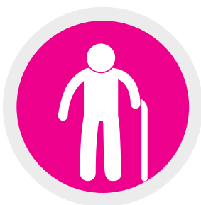
THE OLD AGE GRANT