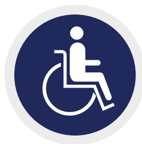
THE DISABILITY GRANT