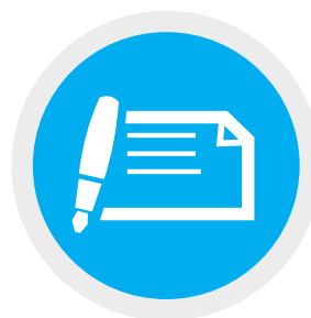
THE OVC CASH GRANT (PILOT PROJECT)