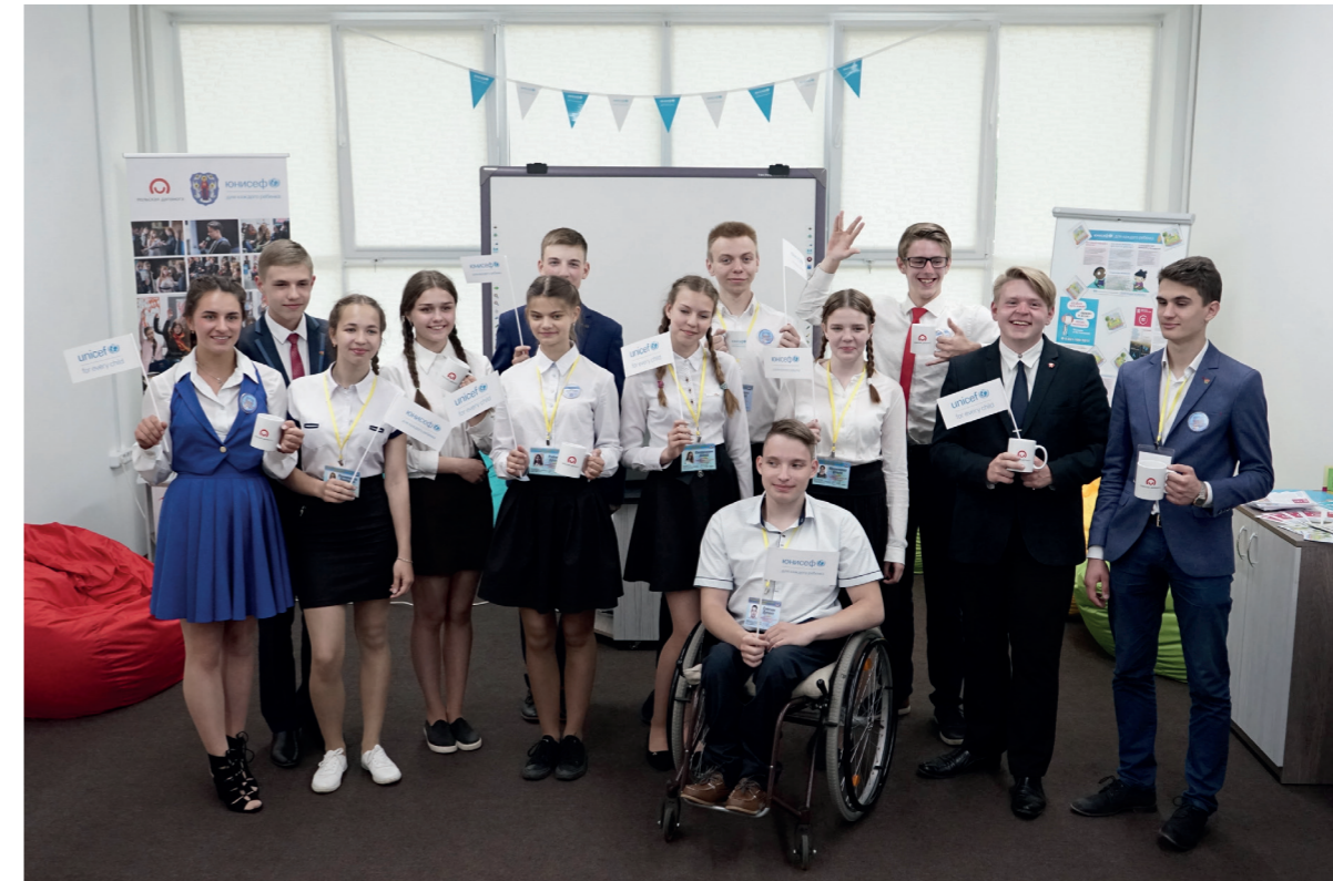
Photo caption: Meeting of Adolescents Parliament of Novopolotsk in the Regional Center on Youth Empowerment “Stupeni”.

The Child Friendly Cities Initiative also demonstrates UNICEF’s global commitment to engaging communities and young people in local decision-making.