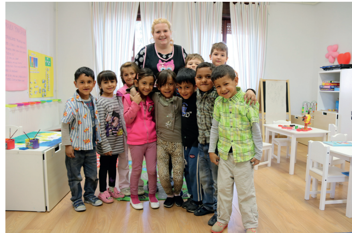
Photo caption: A group of pre-primary age children posing with their teacher in a kindergarten in the City of Sisak in Croatia.