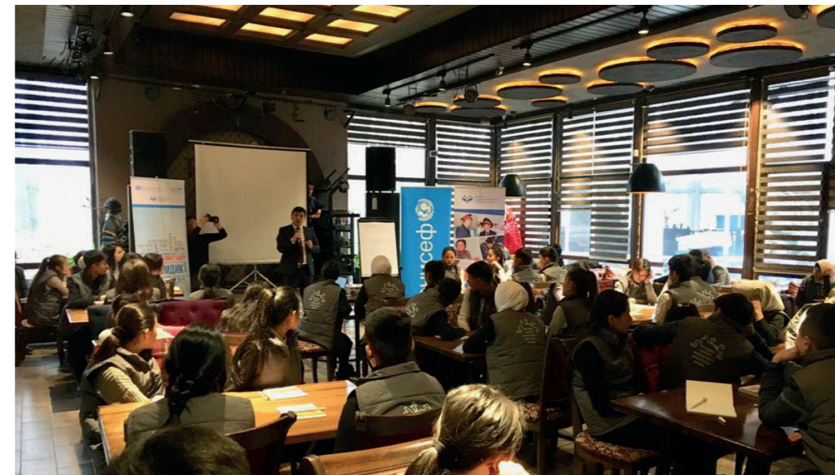
Photo caption: Workshops of social projects are a series of practical workshops and field studies where during the week of the team of young people from Osh discussed, analyzed and identified solutions on a wide range of issues, including access to school education, violence, road safety and much more. During practical exercises, young people created and demonstrated prototypes or visual models of solutions. The most creative solutions of social change received funding for implementation.