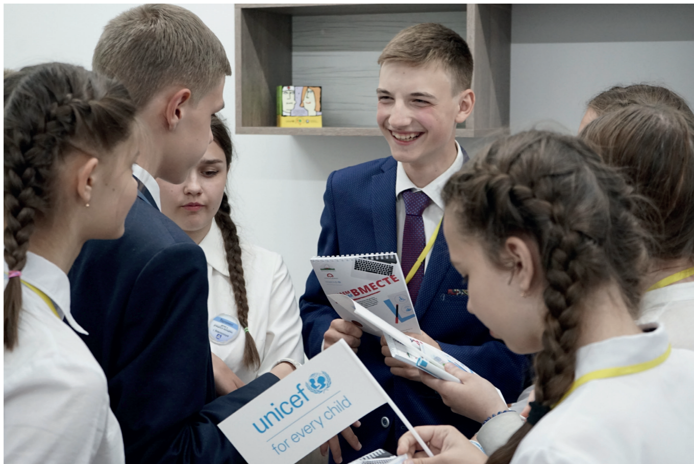
Photo caption: Members of Adolescents Parliament of Novopolotsk participate in the discussion.