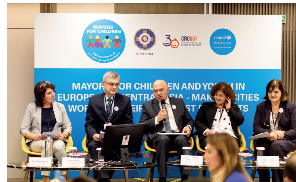
Photo caption: Five panelists from Romania, Belarus, Kosovo, Georgia and Bosnia and Herzegovina (left to right) are presenting their cases on the session "Cities' work to strengthen child health and wellbeing" at the Mayors for Children meeting held in the NJV Athens Plaza Hotel. November, 2019, Athens, Greece.

The region needs generations of young people who are healthy, well-educated, productive and innovative, and who are equipped to take on the many challenges facing a region still going through changes. And the nurture of these generations begins at local level.