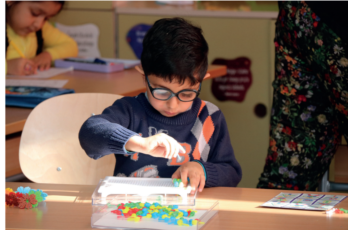
Photo caption: Boy of the Roma national minority playing in a pre-primary education programme in the City of Slavonski Brod in Croatia.

The PPE initiative in Croatia represents, therefore, a promising way to help the most vulnerable and excluded children in a country. It shows that cultural sensitization helps teachers to better understand the situation of their students, and is a way to tackle discrimination and exclusion in cities and towns.