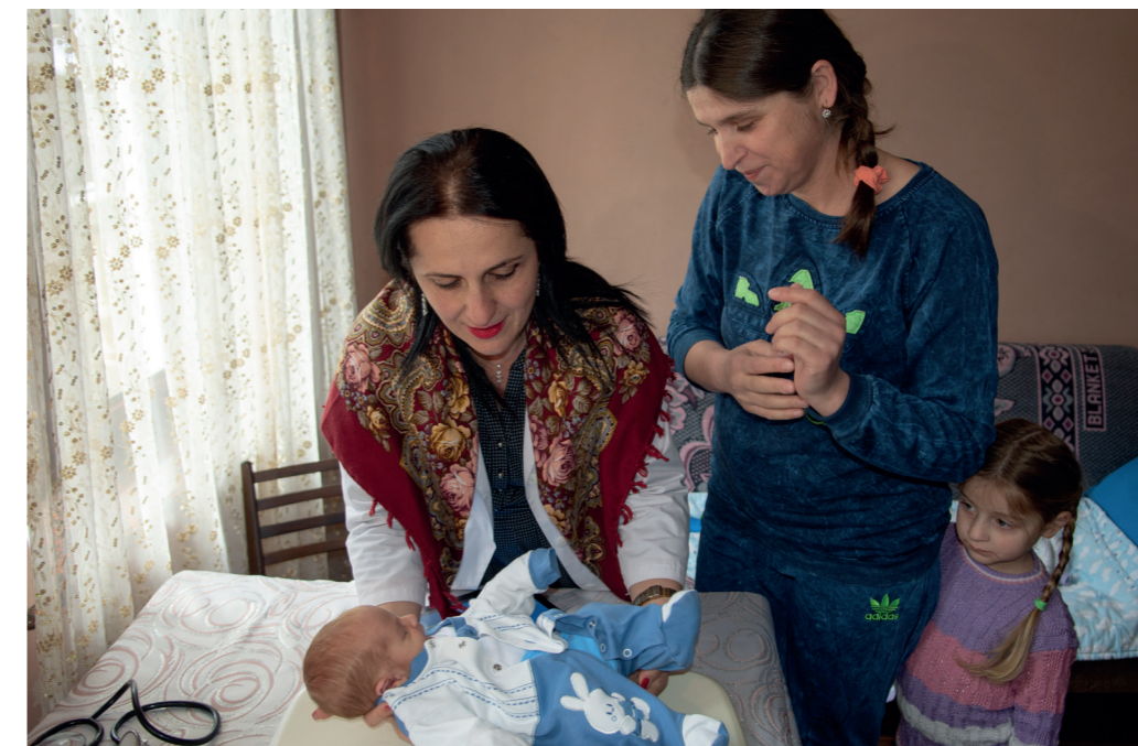
Photo caption: The doctor equipped with tablet is visiting a child to monitor his growth and development. The child growth and development monitoring system for children aged 0-6 was launched in Adjara as a result of cooperation between UNICEF and the Ministry of Health and Social Issues of Adjara. March 2019, Batumi, Georgia.

The Georgia example tells us that local governments benefit from sharing experiences on financing and planning, which are crucial first steps for the implementation of social policies for children. UNICEF aims to help local governments improve their capacities to plan and allocate resources, and monitor the impact of their social programmes, with the full participation of local communities. UNICEF also supports coordination and cooperation across all the difference levels of government, from national to regional to local, and across all sectors that are crucial for child wellbeing.