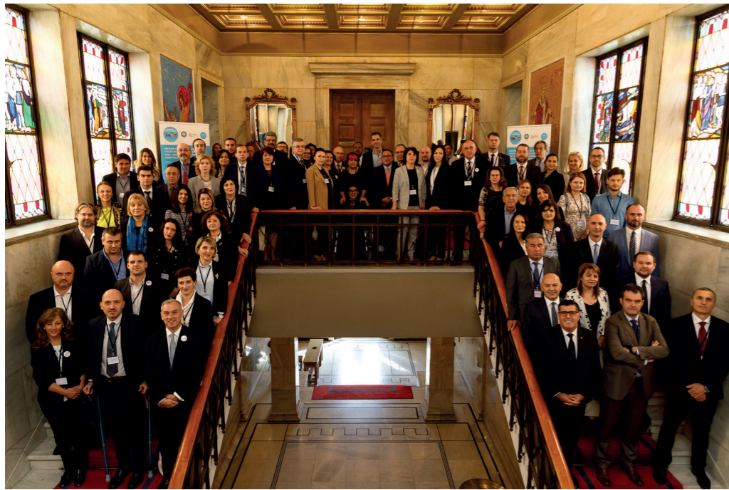
Photo caption: All the participants of the Mayors for Children Meeting standing on the 1st floor of the townhall in Athens, Greece.

and Central Asia Region took part in the "Mayors for Children" meeting, hosted by the City of Athens, Greece. At the first-ever meeting of Mayors in the region that focused especially on programming results for the most excluded children and young people, participants learned more about the critical importance of urban local governments' targeted programming for the youngest residents in their communities, particularly the most vulnerable.