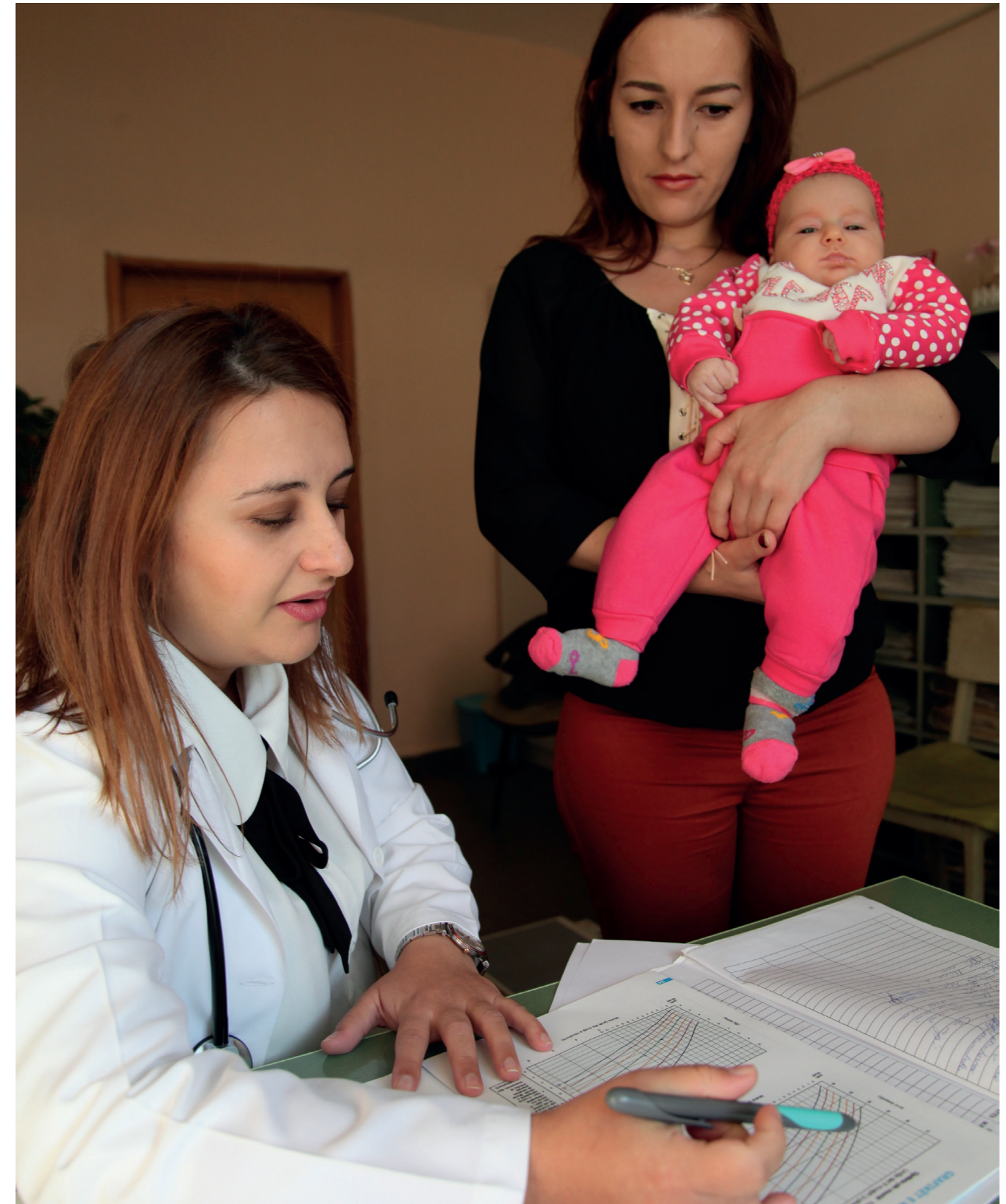
Photo caption: Mother and child visits health center in Durres.