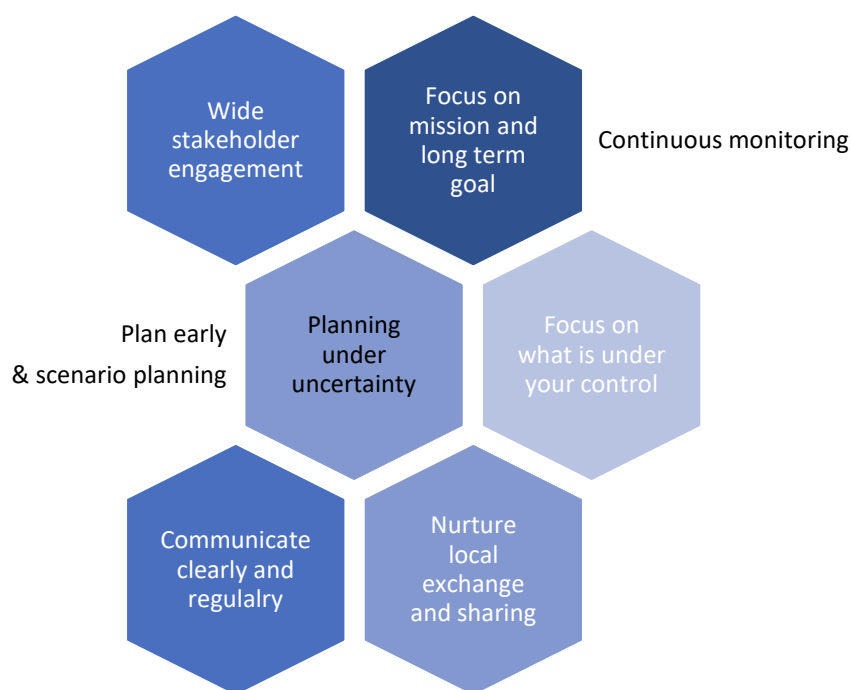
FIGURE 1 PRINCIPLES FOR PLANNING UNDER UNCERTAINTY