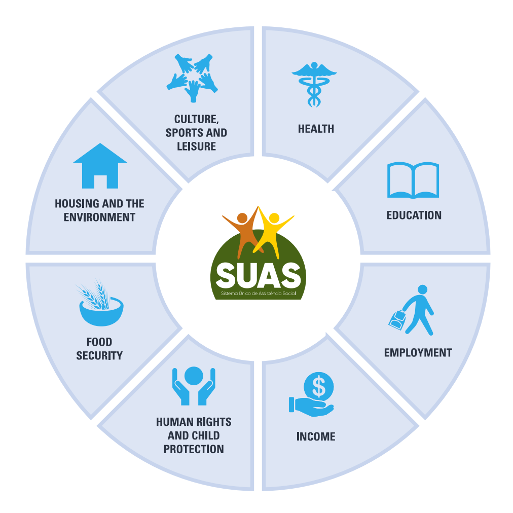
Figure 1. Organizational chart illustrating the intersectoral linkages between SUAS (and social protection in general) and other dimensions of well-being.

the environment, culture, sport and leisure. At the end of the day, one could even argue that there is no such thing as a social assistance policy disconnected from other areas. Even more so, the very distinctive element of social assistance lies precisely in its ability to coordinate and integrate with other more specific sectoral policies, such as those listed above and illustrated in Figure 1.