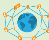
International organisations (like UNICEF)