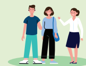
Parents, caregivers, teachers