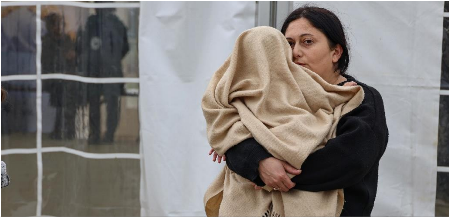
A mother and child waiting at the Humanitarian Centre in Kornidzor in September 2023.