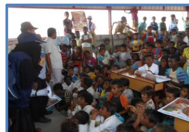
MRE awareness activities in Haradh