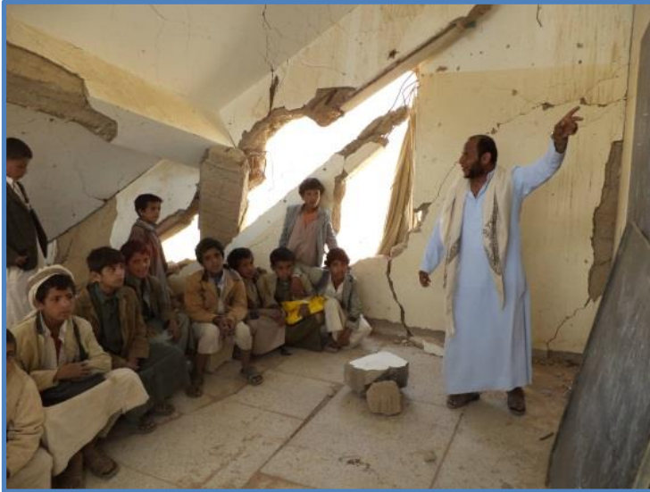
Children study under a collapsed roof in a school destroyed during the Sa'ada war.