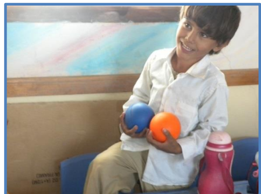
A child plays in an ECD classroom