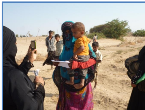
Community Volunteers visit the hardest to reach areas to screen children for severe acute malnourishment (SAM)