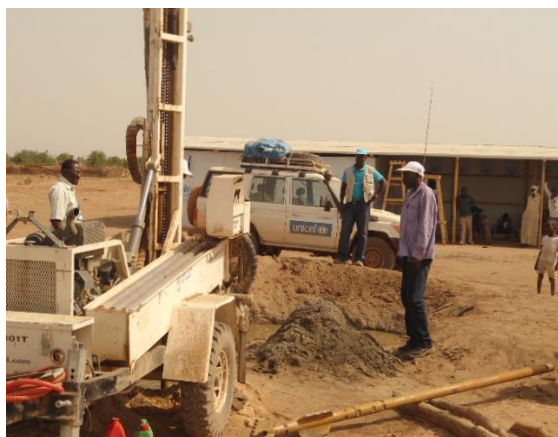
WASH Infrastructures for Refugees