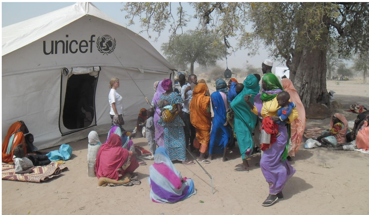
UNICEF supported Health Clinic in Tissi