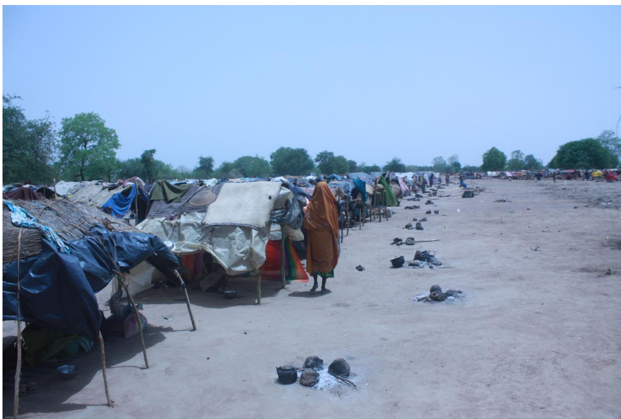
Returnees Sites in Rout-Rout, 30 km out of Tissi, Pic@Dramon