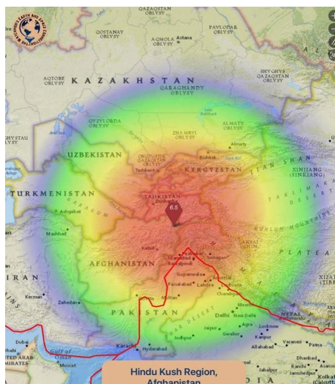
On 23 March, a 6.5-magnitude earthquake struck northern Afghanistan in Badakhshan Province.

Although schools opened in March after the winter break, the ban on secondary education for girls remained. There is still no indication on whether this ban will be lifted. UNICEF continues to monitor the situation through continuous engagement with de facto authorities (DfA), UNICEF staff, technical extenders, and partners.